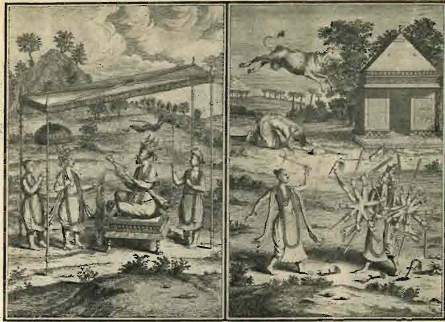
Fifth and Sixth Incarnations

body of a fish and fastened the ark to His own body by means of a cable fashioned out of a serpent. When the flood subsided, Vishnu slew an evil monster who had stolen the Vedas, or sacred books of the law. The books being returned, a new human race was formed who treasured the sacred writings and obeyed them implicitly. In the sacred books of the Hindus the story of the first avatara requires 14,000 verses for its recital.