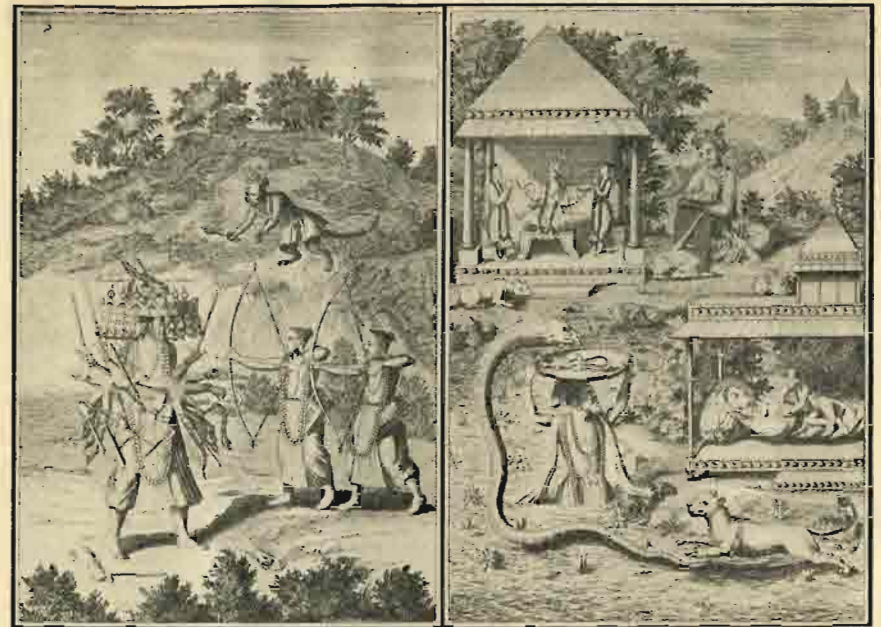
Seventh and Eighth Incarnations

The fourth avatara of Vishnu is termed the Narasingha , or man-lion, incarnation. This is the story of a holy man who for ten thousand years prayed and meditated for the boon of universal monarchy and that of ever-