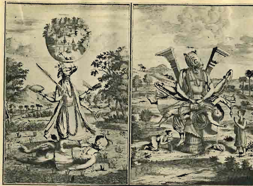
Third and Fourth Incarnations

"When virtue fails upon the earth, then I come forth," says Vishnu in the Bhagavad-Gita, and according to the secret doctrine of the Hindus the Great Mind has come into objective manifestation nine times already that He might prevent the failure of civilization. These incarnations of the Lord of the World are called the avatars or the incarnations of the Great Savior. Vishnu appeared for one or more of three reasons: (1) to overcome some great evil in the world threatening the future of humanity, in the legends this evil being usually personified as a wicked king, or a great monster such as a dragon or ferocious demon; (2) to purify the faiths of men from that con-