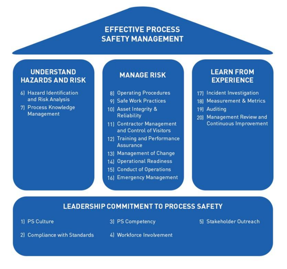
Figure 4: Twenty elements for effective process safety as adopted by Unilever

The programme is underpinned by a company process safety management standard which is based on the CCPS Risk Based Process Safety Guidance ( CCPS , 2007) and comprises the twenty elements shown in Figure 4 .