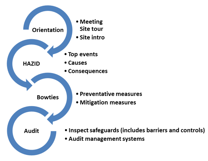
Figure 5: Format for Unilever Site Audits

The output from the Unilever site audits is a spreadsheet covering each of the twenty process safety elements and highlighting commendable practices and deficiencies where these exist. The deficiencies are categorised depending on their severity as shown in Figure 6 .