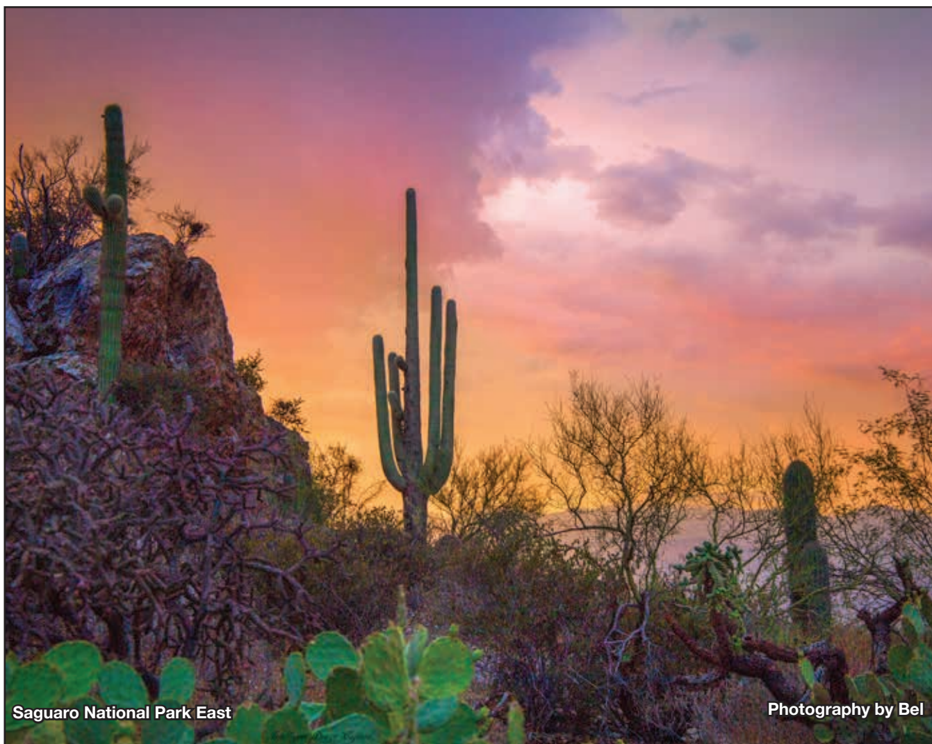
Saguaro National Park East