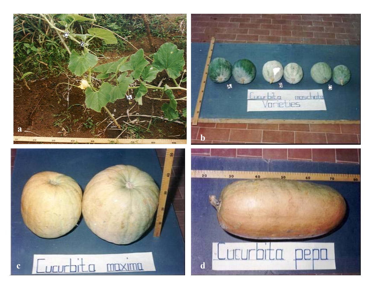
Figure 1(a-d). Characteristic features of habit and fruits Cucurbita species studied. a-habit of Cucurbita species showing severally coiled tendrils represented with letter 'a'; b- three fruit varieties of C. moschata. ; these varietal forms are occasionally produced by one plant; c-fruit of C. maxima ; fruit stalk is deeply depressed into the fruit forming a globose invagination; d- fruit of C. pepo ; fruit stalk is round, neither depressed nor sunken into the fruit.

anatomy will also provide a guide and basis for studies leading to further exploitation of these important vegetable species.