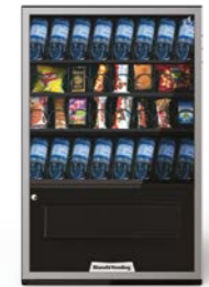
ARIA S EVO 4 trays

COLUMN: side column that can hold 50cl water bottles or cans.