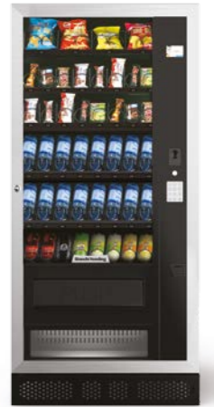
ARIA L EVO 6 trays