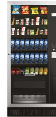
ARIA PLUS L EVO 6 trays / 1 columns / Electronic tags optional