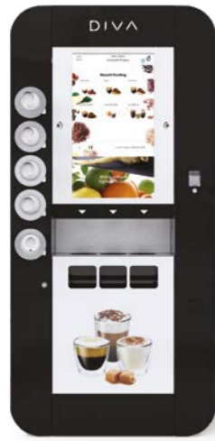
DIVA 2 cup sizes / Manual cup dispenser / ESV / Topping and syrups / Touch 32"

Hot drink dispensers that create added value for your business.