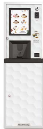
LEI250 ES and ESV / Easy, Smart and Touch 15"

ES: espresso coffee group ESV: brewing unit variable chamber IN: instant coffee