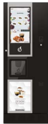
LEI400 400 cups / ES, ESV and IN / Easy, Smart and Touch 21"