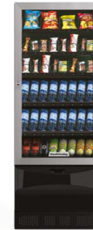
VISTA L (Slave) 6 trays