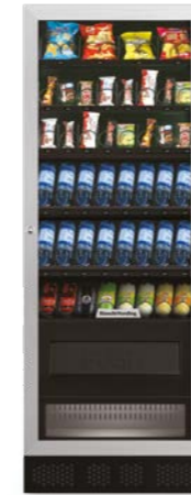
ARIA L EVO (slave) 6 trays