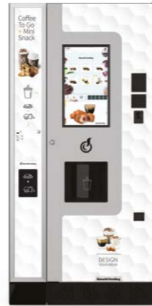
LEI600 PLUS 2CUPS + MODULO COFFEE TO GO 2 cup sizes / 1000 cups / ES e ESV / Topping / Lids and mini snack / Touch 21"