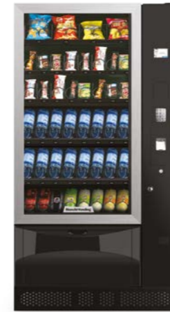
VISTA PLUS L 6 trays / 2 columns / Lift optional / Electronic tags optional / Version with Touch 46"

Cold drink and snack dispensers that integrate with and complete your offer.