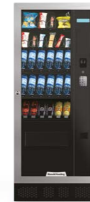
ARIA M 5 trays