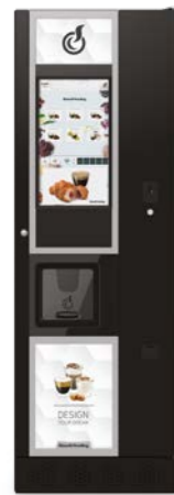
LEI600 600 cups / ES, ESV, ESV BC and IN / Easy, Smart and Touch 21"