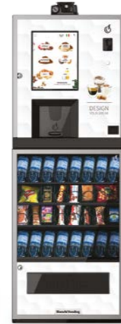
LEI300 EVO 2CUPS + ARIA S 300 cups / ES / Easy, Smart and Touch 15"