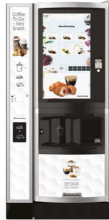
LEI700 PLUS 2CUPS + MODULO COFFEE TO GO 2 cup sizes 1000 cups / ES e ESV / Topping / Lids and mini snack / Touch 32"