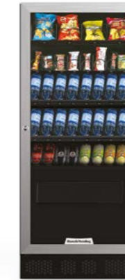
ARIA M (slave) 5 trays