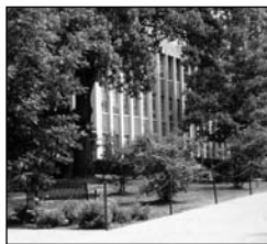
Randolph Hall, Home of Chemical Engineering

NON-PROFIT ORG. U.S. POSTAGE PAID BLACKSBURG VA 24060 PERMIT #28