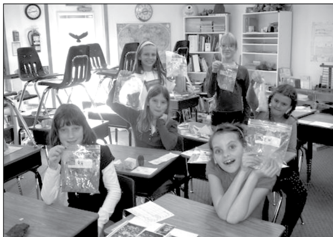
A group of happy Tall Oaks Montessori students display their silly putty.