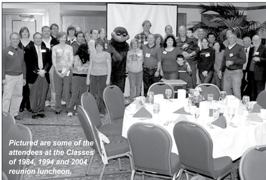
Pictured are some of the attendees at the Classes of 1984, 1994 and 2004 reunion luncheon.

We plan to hold a similar event in the fall for alums from the classes of 1985, 1995 and 2005.