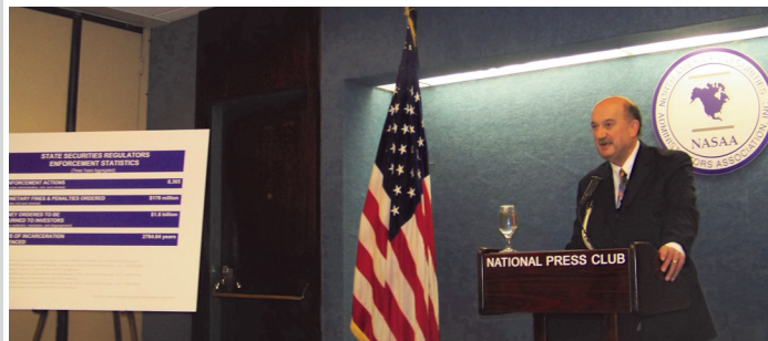
NASAA President Fred Joseph outlines NASAA's 2009 legislative agenda and meets the press at the National Press Club in Washington, DC.

NASAA unveiled its legislative agenda at a Jan. 29 press conference at the National Press Club in Washington, DC.