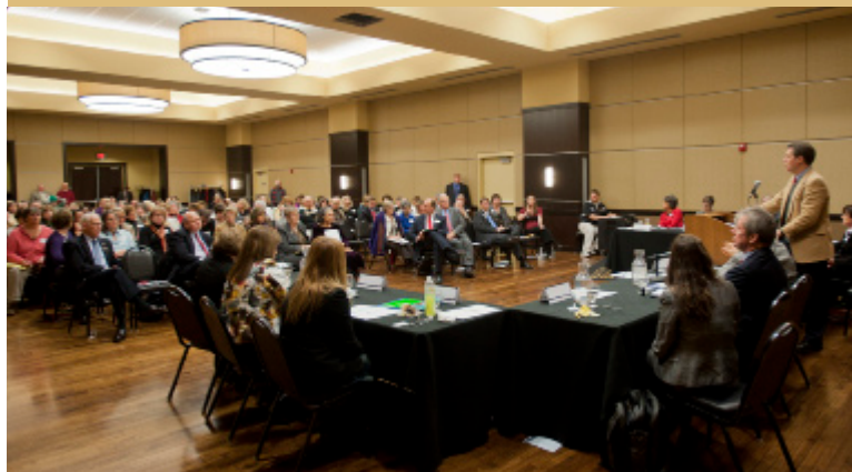
The summit was held in the recently renovated Webb Hall in the Memorial Union.

Gov Brownback said the information shared and gathered at the summit will be used to develop an action plan for the state's role in improving literacy.