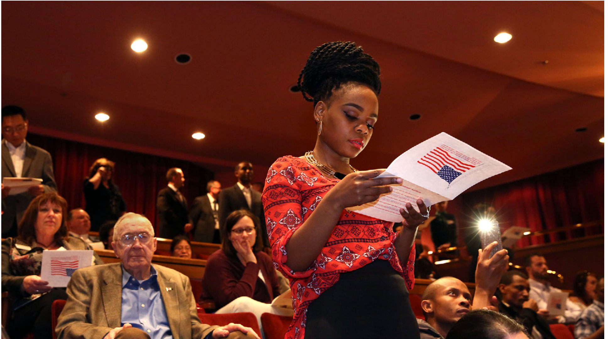
A Johnson County Community College student reads the oath of citizenship during a naturalization ceremony, while friends and family capture the moment on mobile phones.