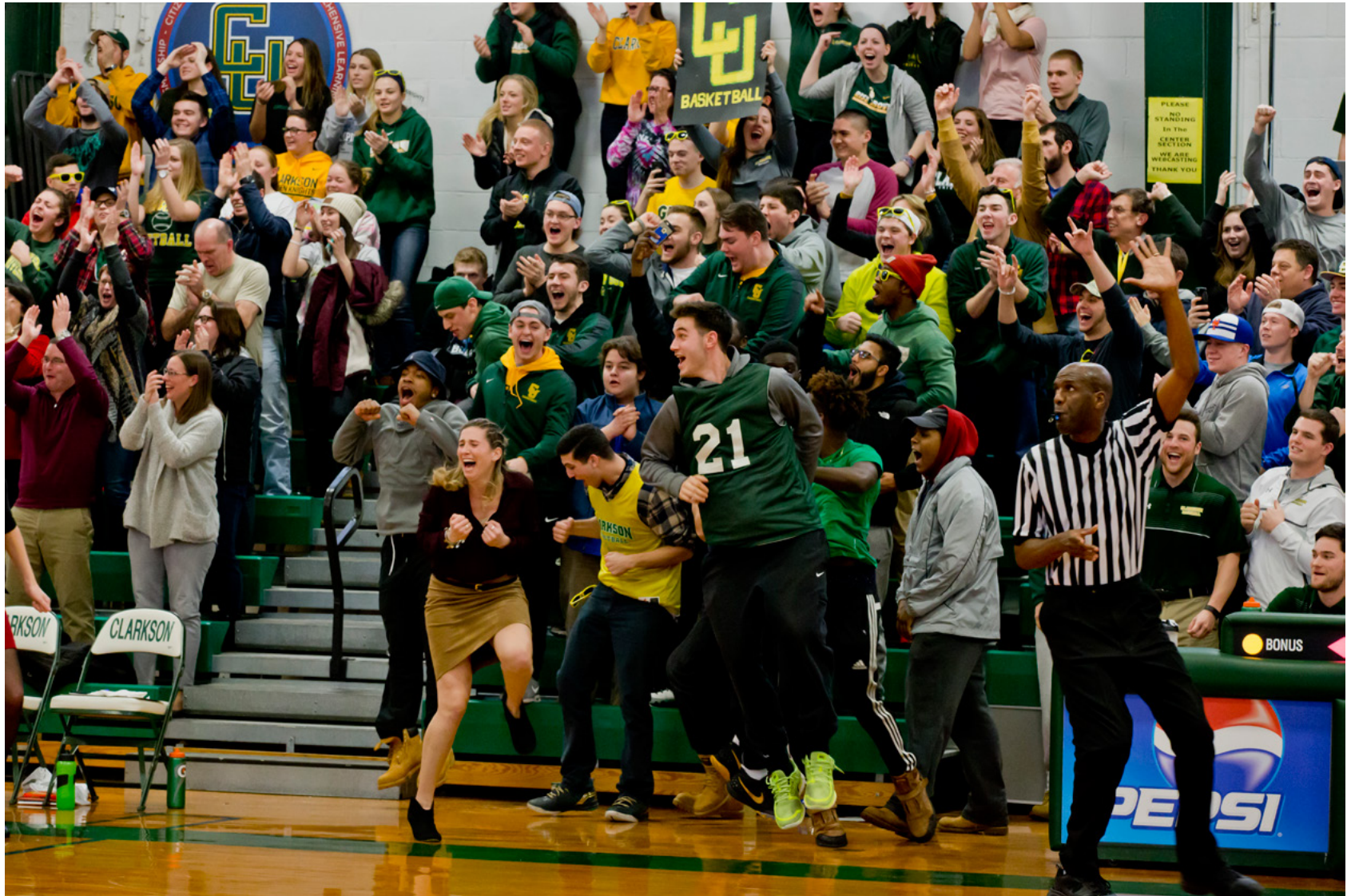
Pure elation on the sidelines as the The 2015-2016 Clarkson University Women's Basketball team scores a victory during its the best season in over 25 years, winning the Liberty League title.