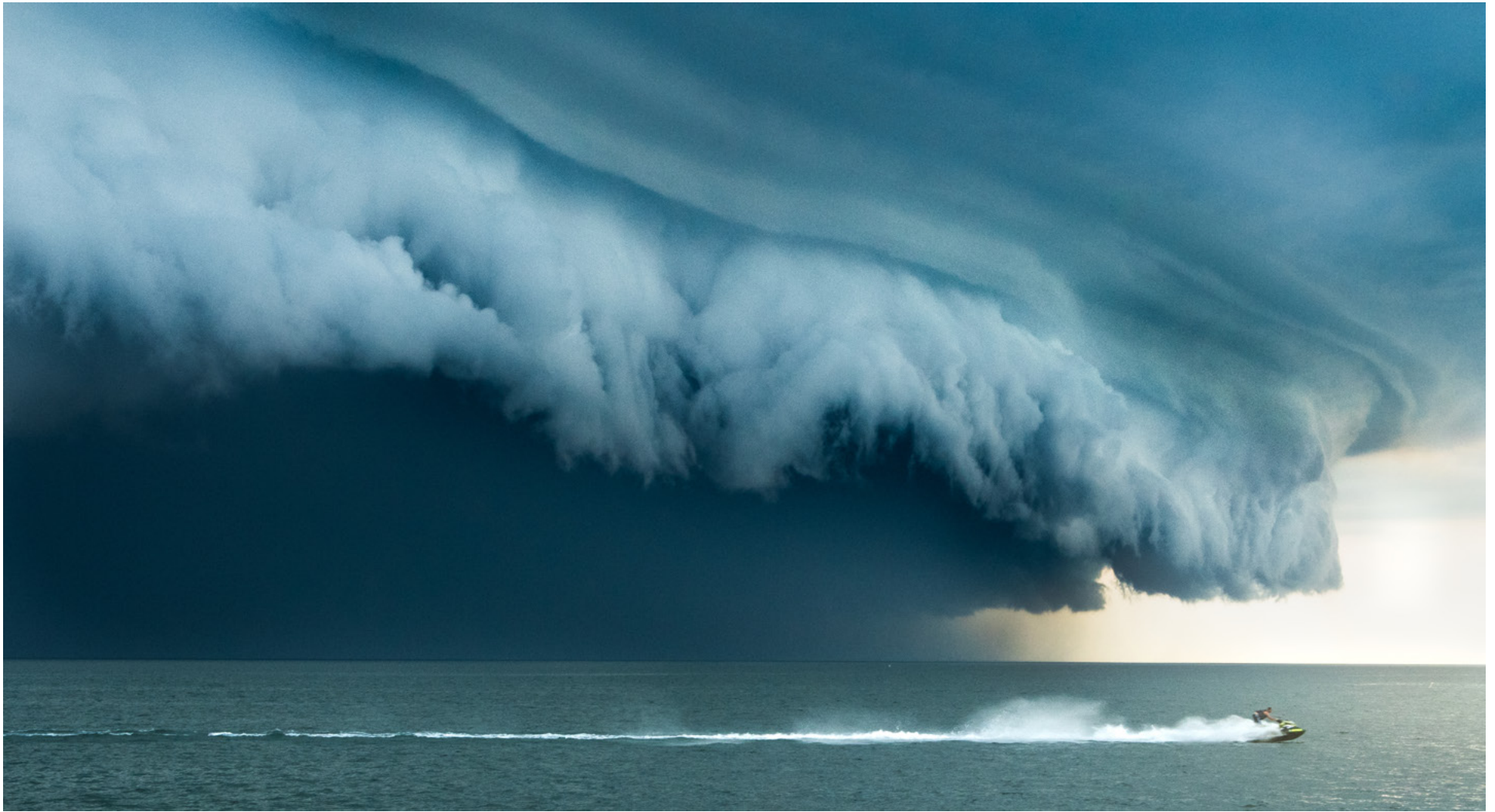
Storm Clouds over a speeding jet ski at Edgewater Beach in Cleveland in August 2016.