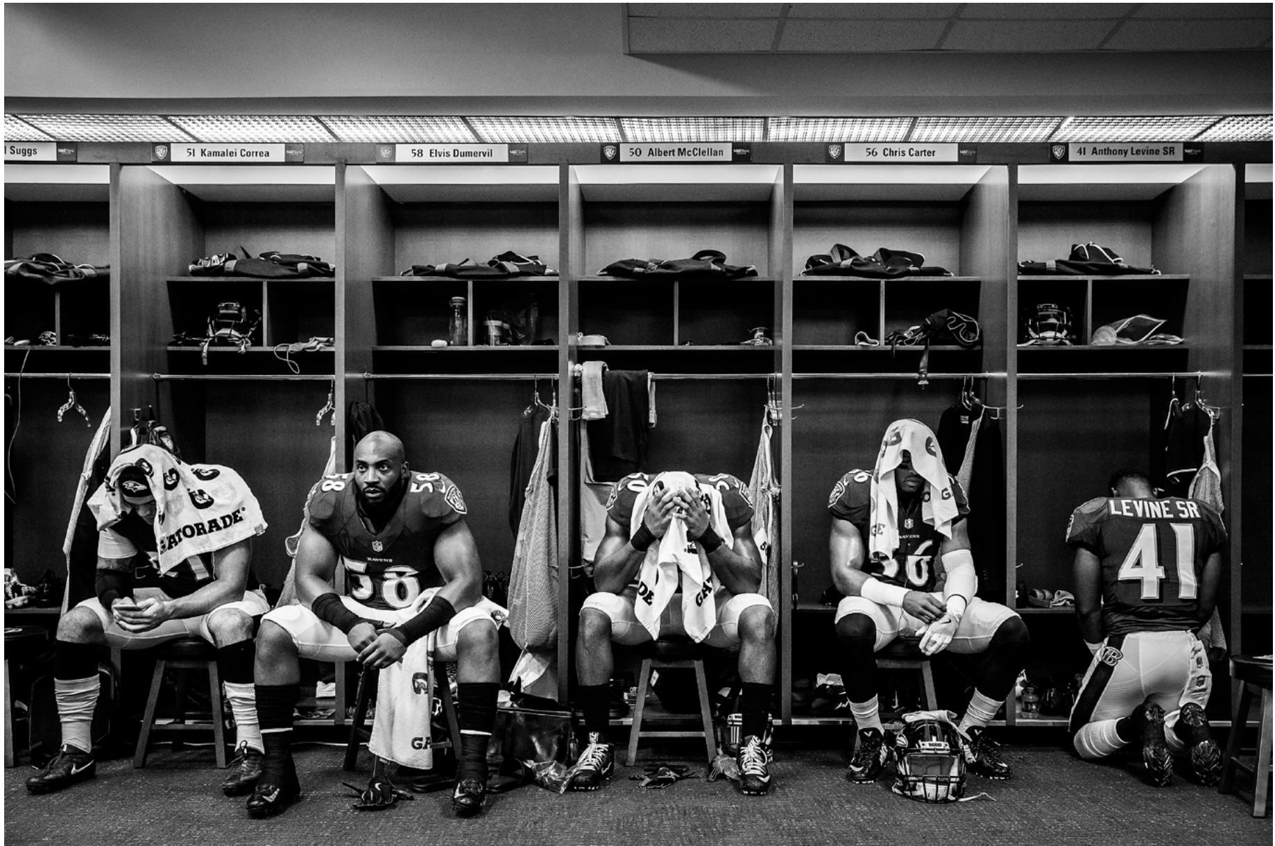
Ravens players mentally prepare to take the field before their matchup with the Oakland Raiders on October 2, 2016.