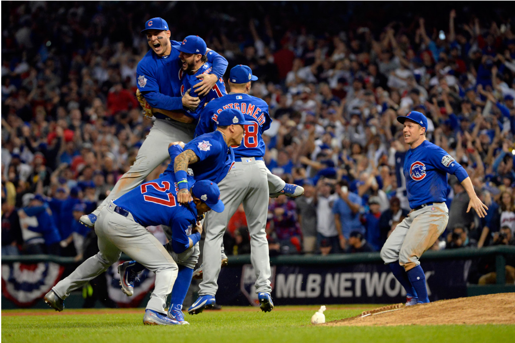
Moments after the Chicago Cubs defeated the Cleveland Indians in Game 7 of the 2016 World Series, the team celebrates their first World Series victory in 108 years.