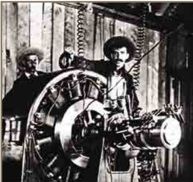
Ames Hydro operators gather around the big Westinghouse generator.