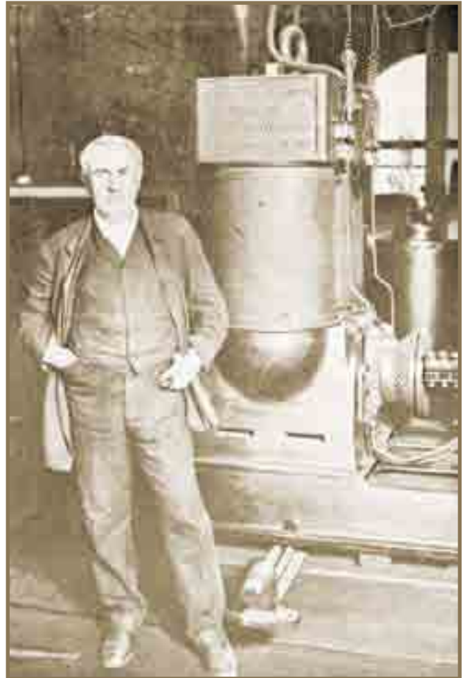
Edison's inventors improved the early dynamo designs.

He progressed from this system to the three-phase system—three voltage waveforms, 120 electrical degrees out of phase with each other. This system requires only three wires, and was electrically balanced, since the voltages add up to zero. In 1883, Tesla had built his first working AC motor, producing motor rotation for the first time without a commutator.