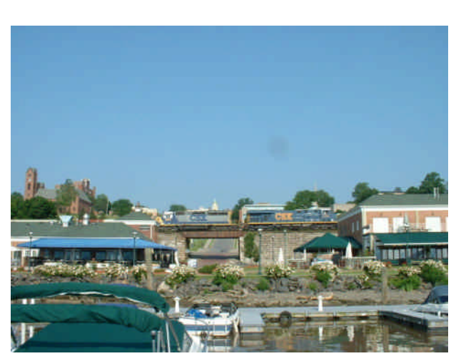
This shot was taken from the parking lot of the marina.