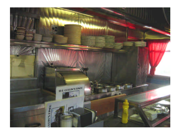
This is in reference to the photos that were in lasts month's Manifest (Jan 2007 issue), the one with the clock face cover.

On Jan 9, 2007 I was in Canaan and took some photos of the station reconstruction. Looks good at this point. There is more work needed to install the siding and doing the interior. The building seems to be well enough along so we don't have to worry about the project dying. The window molding is reproduced exactly like the existing ones. An architectural purist may wince at the "Tyvek" but once it is covered, who is to know. I peered into the window and can see that the framing is complete but the interior sheetrock has yet to be installed. However at the time I was there, there was no construction activity going on. I was there on a weekday early afternoon at around 1:30 and there were no workers, vehicles or tools present. I was told by a local that further funding needs to be approved. I know that governments work at glacial speed in this respect. The station looks great at this stage but I hope that the impasse does not last too long.