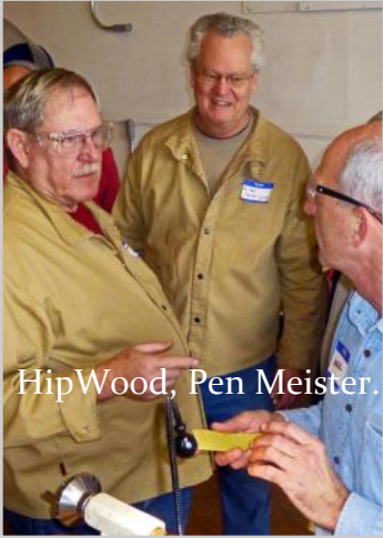
HipWood, Pen Meister.