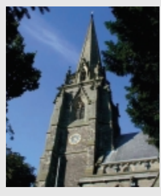
Carry on up the hill to Saint Mark's Church - enter via first gate. (Note for wheelchair users - there are steps up to the churchyard which may be difficult to access)

Turn right, cross over Worsley Road and walk up the hill, under the motorway bridge