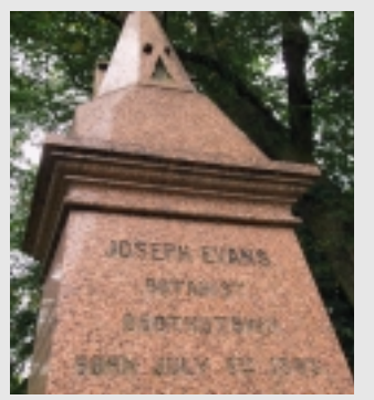
From the church walk back down the hill on the same side of the road and left along Worsley Road to the road bridge over the canal. From the bridge look over at The Delph (to your left)