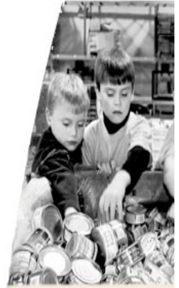
Youngsters pick out pantry items donated to Harvesters

Volunteers generally get a two-block assignment.