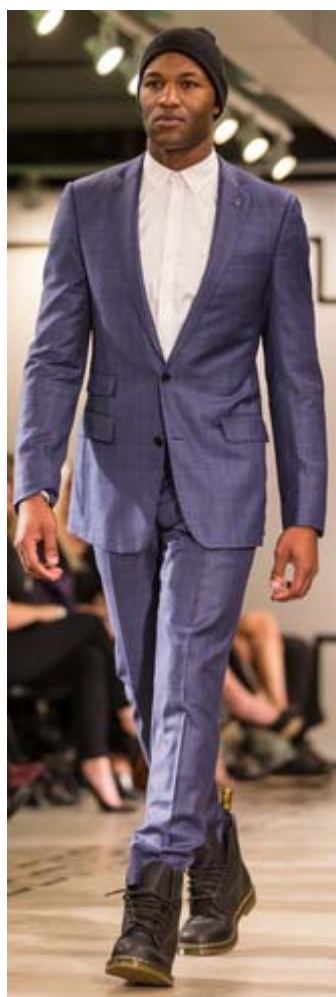
League of Rebels Men's Wear.

FXD provided the audience with pop up shops, nightly fashion runways and the last evening ending with designers from Lifetime's hit TV show