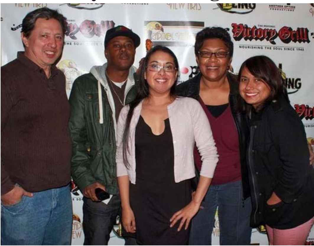
East Austin Studio Tour artist at the historic Victory Grill

East Austin Studio Tour kicked off this weekend with a full roster of visual artists and schedule of events. Since 2011, Capitol View Arts and the Victory Grill have participated in the tour, giving local minority artists a chance to exhibit for the public. GIVE Gallery, Gallery in Victory East, transforms the historic venue into an art exhibition featuring six artists.