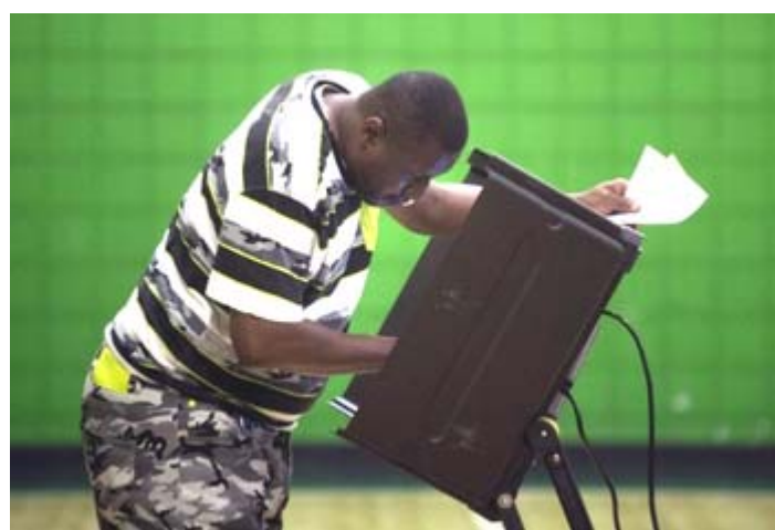
Greensboro, N.C. voter casts his ballot on Election Day.

Perhaps the most interesting numbers: Among people who say Fox News Channel is their most trusted media outlet, 76 percent say voter fraud is the bigger issue, while just 12 percent cite disen-