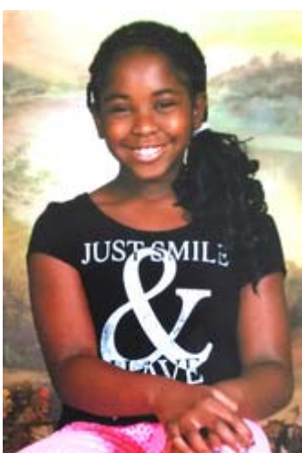
SaNaya White Cedars Int'l Academy

I'm finally done! I finished my documentary on the American Revolution. My group in class finished our scripts and now we are ready to film it. There are 6