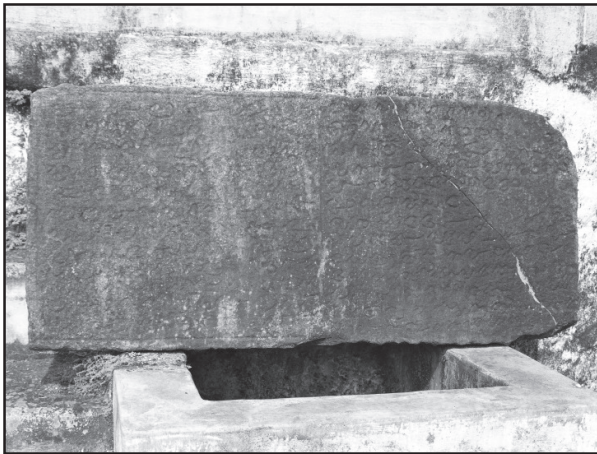
Picture of Muttuchira inscriptions published in Kerala Society Papers, series 5, p 253, 1928-1933, reprinted in 1993, The State Editor, Kerala gazatteers, Thiruvananthapuram, Government of Kerala