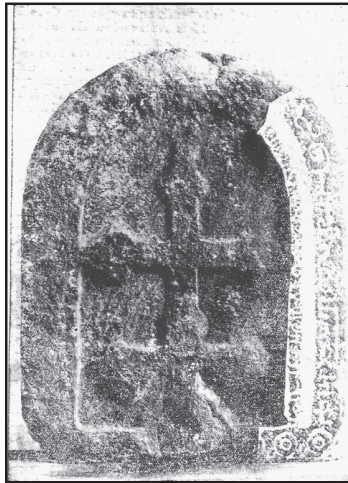
The Picture of Muttuchira Sliva published in Travancore Archaeological Series vol 7 Part I, plate facing page 78 Block no. 5 published in 1930