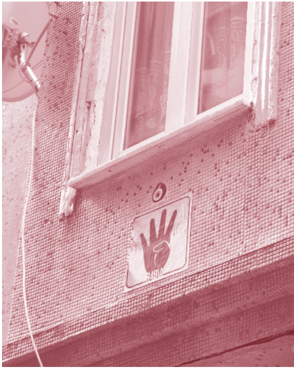
“Rabia” sign on a Tophane residential building.