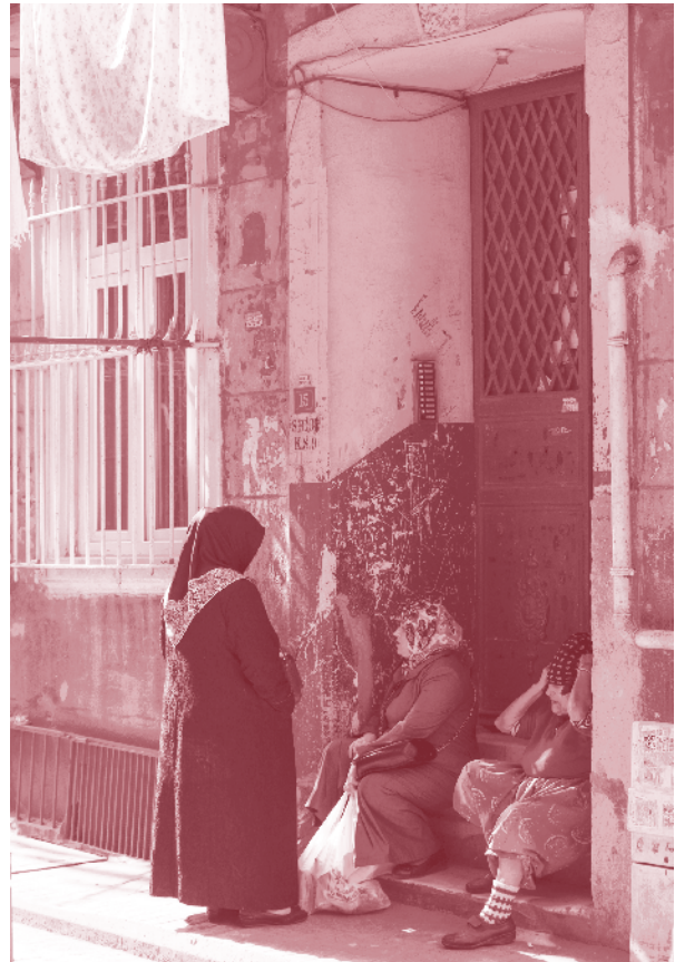
Women sitting and chatting in front of private buildings in Tophane's non-busy back streets.