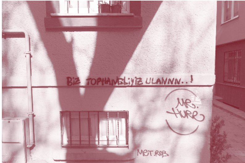
Tophane graffiti tags as territorial markers: The photo on the left is a graffiti tag of Tophane close to Galata Tower. The photo on the right is a graffiti tag in one of Tophane’s side streets.