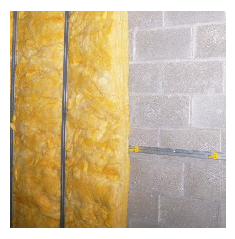
Figure 6 Internal dry-lining on blockwork with thermally efficient fixings

Significant advantages of externally applied insulation are its ease of application and also of checking its continuity. Tightly-butted or lapped sheets deliver thermal continuity with little difficulty.