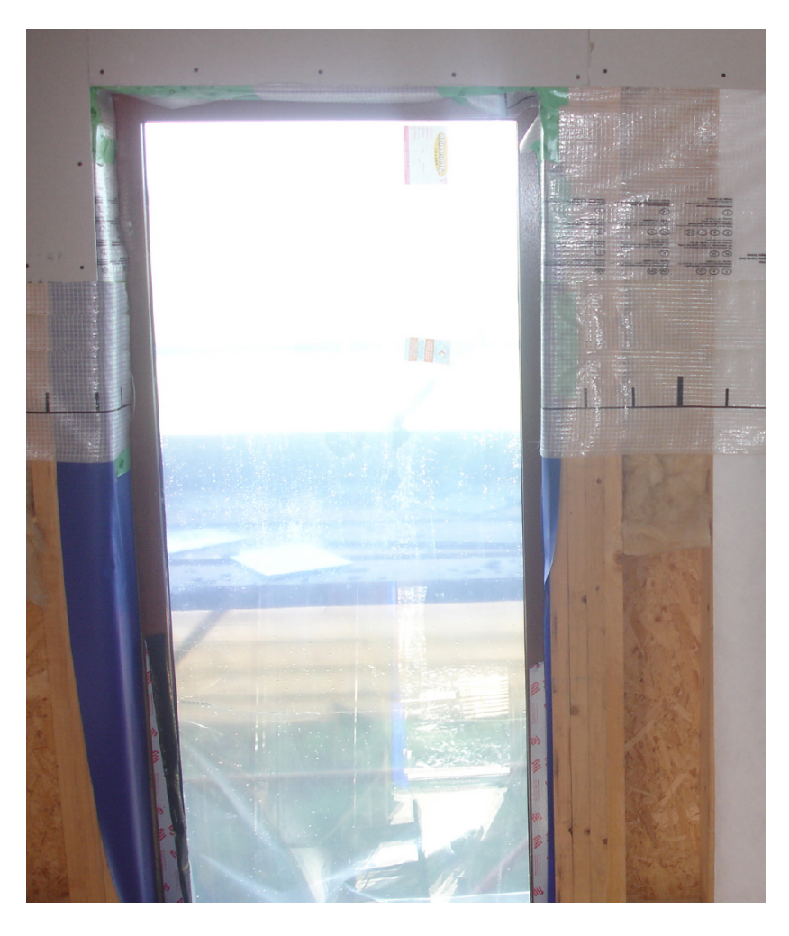
Figure 12 Sealing under way at junction of timber frame wall and external wall ope