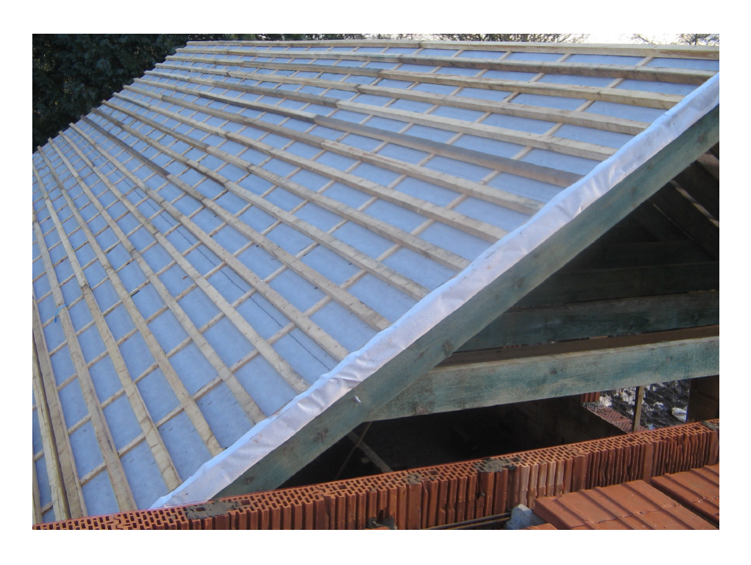
Figure 16 Roof with ventilated counterbattens and unventilated attic