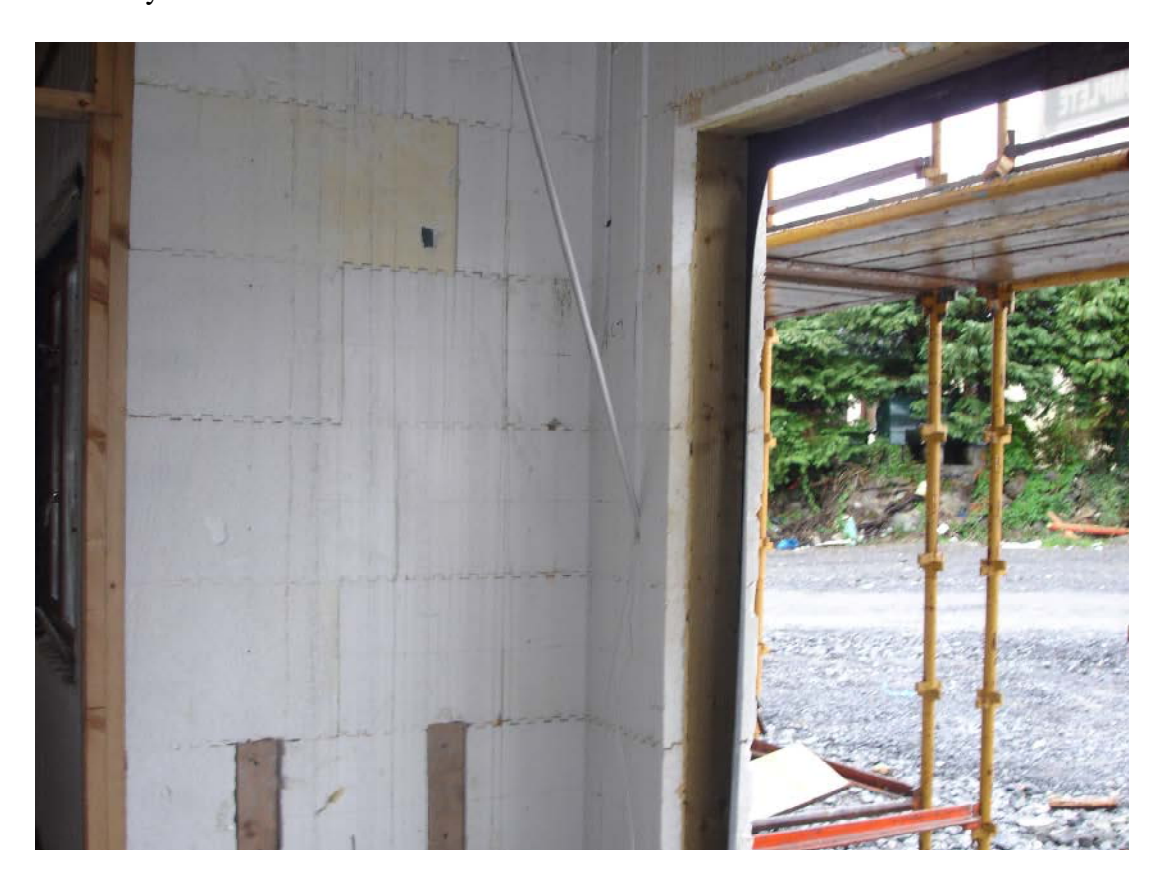
Figure 11 Internal insulation carried well up to the external wall ope