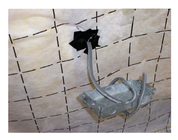
Figure 13 Sealing around connection to electrical socket outlet

Extract fans should be installed and sealed to prevent air leakage occurring through plasterboard finishes. A continuous ribbon of adhesive should be installed around the duct penetration at the air tightness barrier. Where possible the ducts should also be sealed to the blockwork inner leaf. Extract fans may also be fitted with external flaps to minimise air infiltration through the unit.