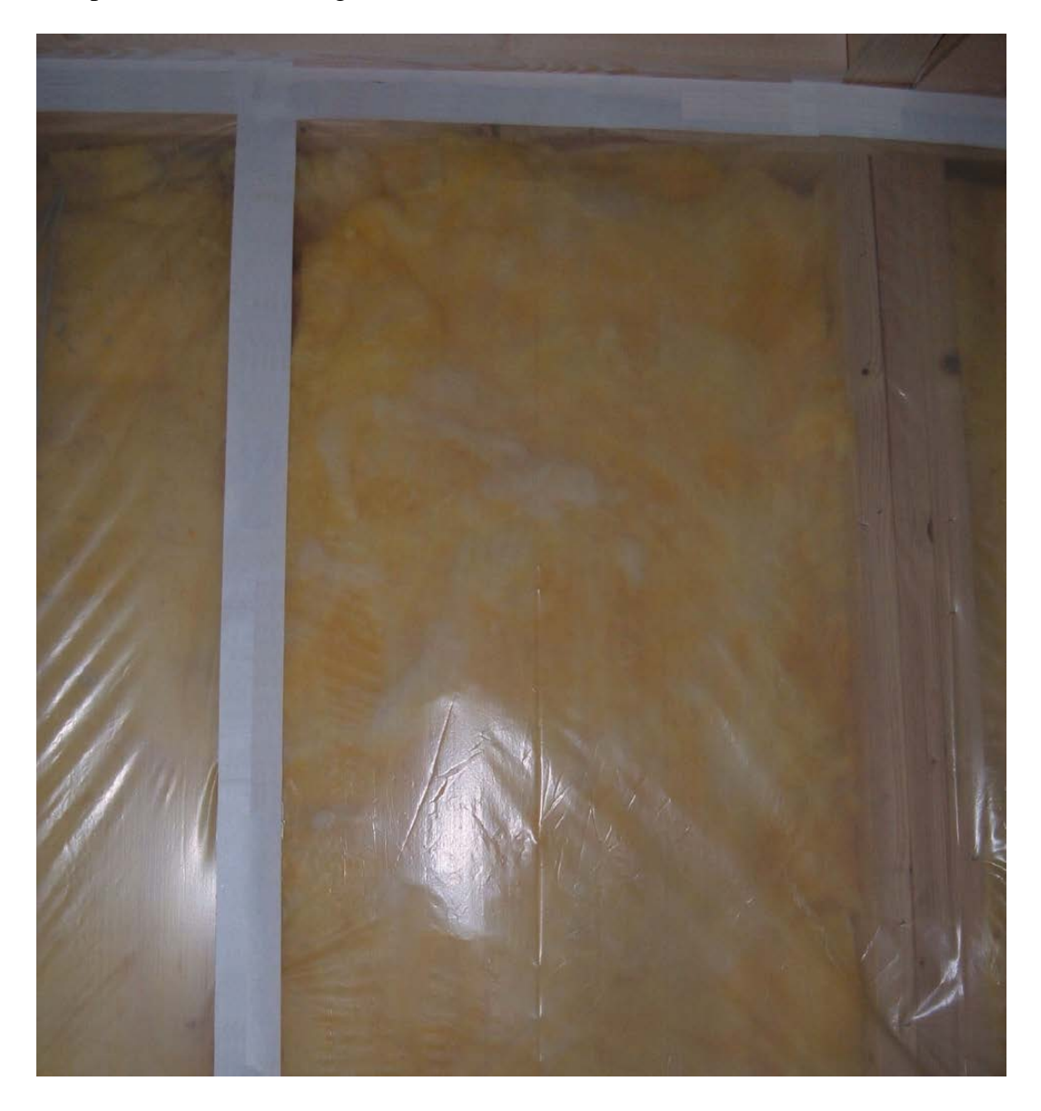
Figure 8 Joints sealed in air tight membrane

The internal plasterboard layer provides air tightness and is simply executed. Sealing the junctions of the plasterboard with the surrounding construction is key. This includes at intermediate floors, roof and ground floor, external wall opes and service penetrations. For best practice, use an air-tight membrane as illustrated.