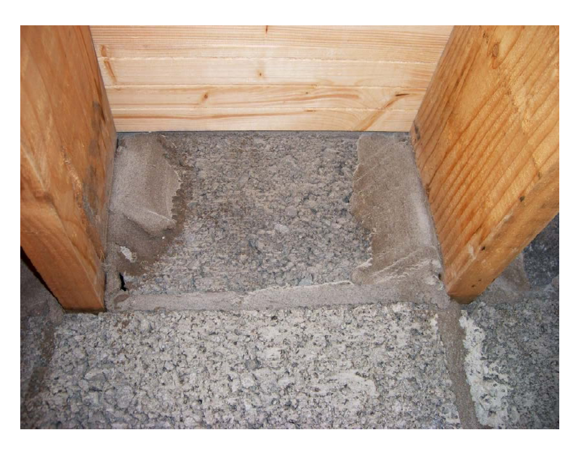
Figure 9 Sealing at intermediate floors: First stage: point up around joists