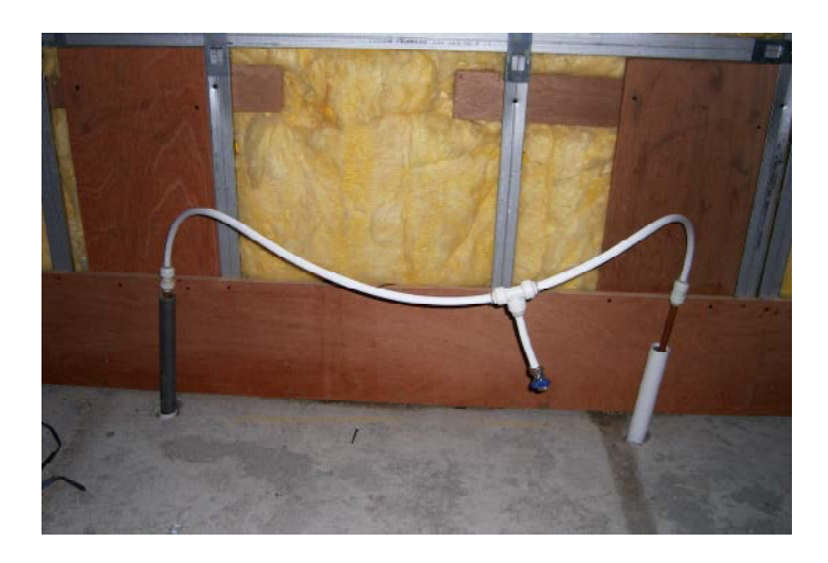
Figure 14 Ply backing on lightweight frame, to hang services and minimise penetrations through insulation and air tightness barrier