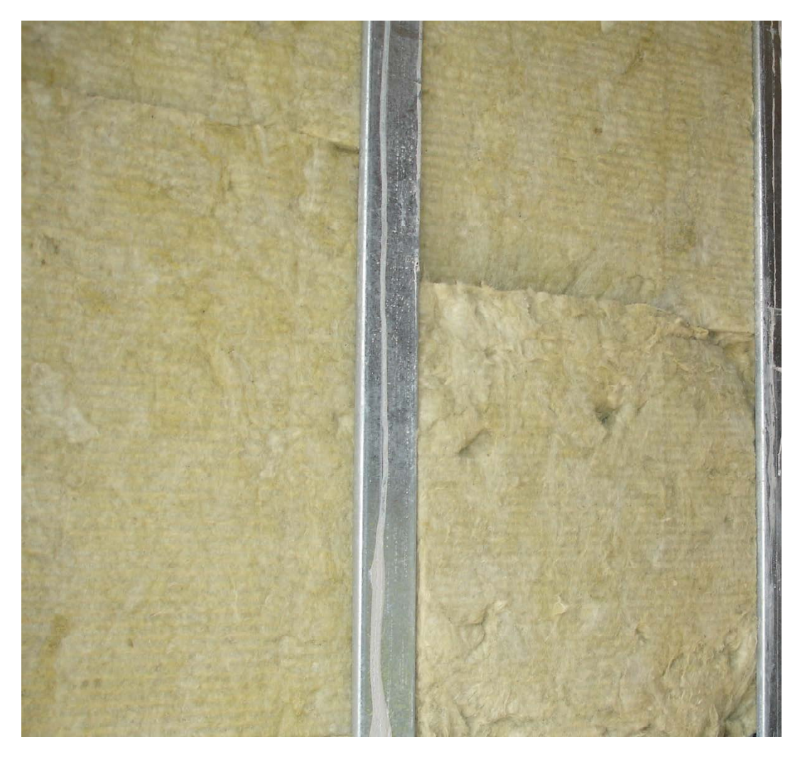
Figure 7 Tightly-fitting insulation in lightweight frame