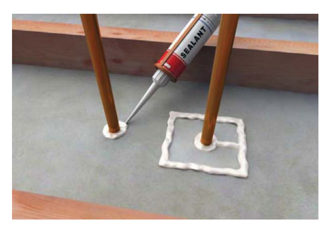
Figure 4 Sealing where pipes enter the roofspace