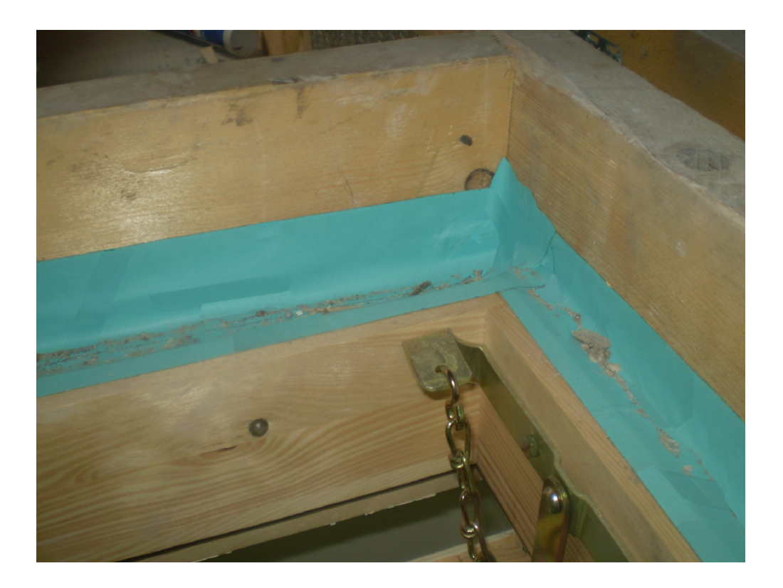
Figure 15 Sealing around frame of access hatch to attic

The plasterboard cheek linings will form the air barrier. The linings should form a continuous air barrier and be sealed to the window frames. Proprietary products are available to assist the formation of air barrier continuity at such interfaces.