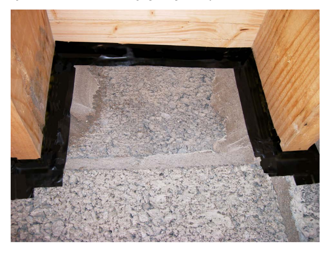
Figure 10 Sealing at intermediate floors: Second stage: tape joists to wall