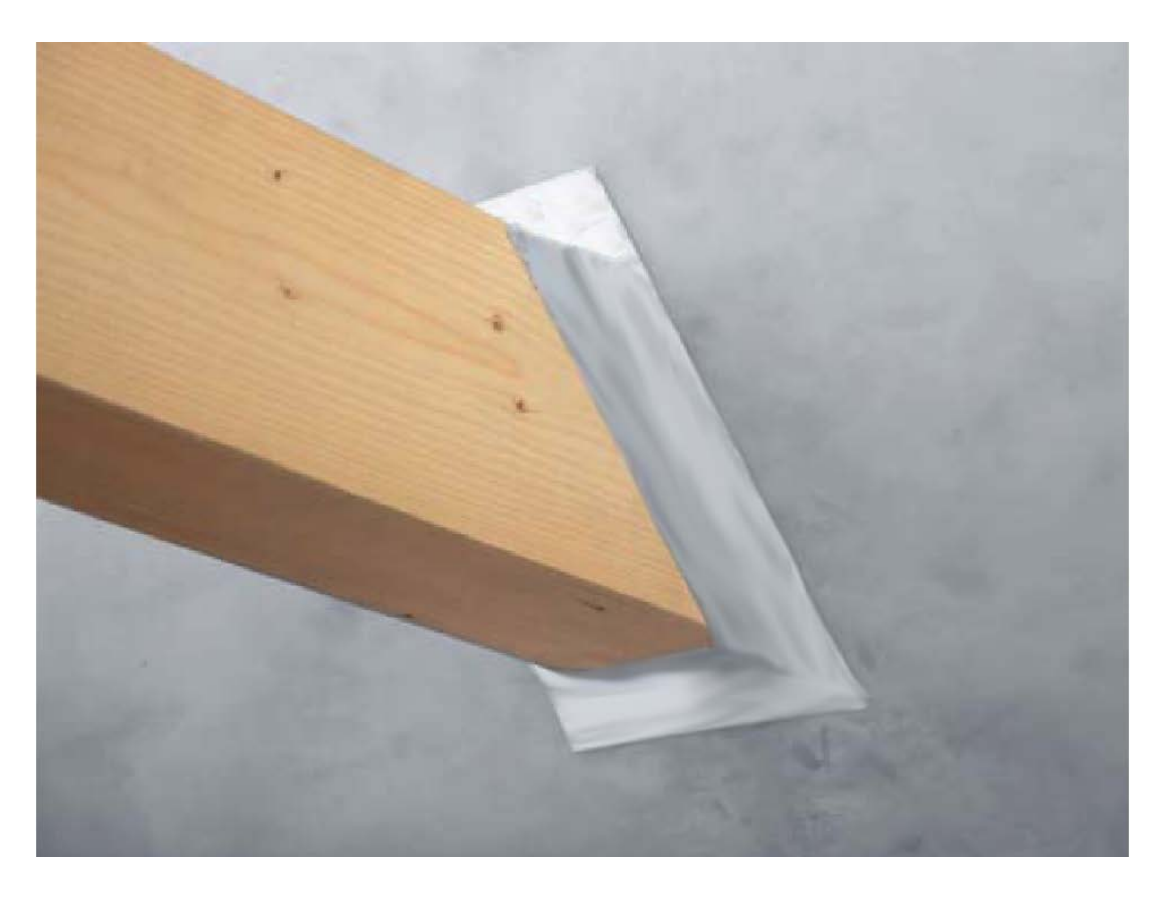
Figure 3 Sealing the junction between the joist and the external wall