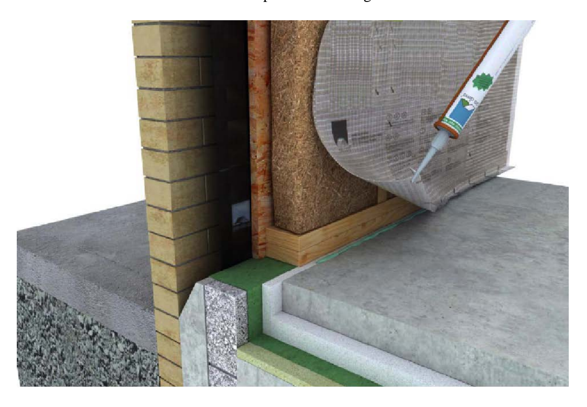
Figure 5 Bonding an air-tight membrane to the concrete floor slab

Timber floors :- Boarding is prone to shrinkage. This can render the floor leaky. Fixing plywood sheeting across the boards and taping gaps can create an air tightness barrier. A continuous sealed floor finish can also provide an air tightness barrier.