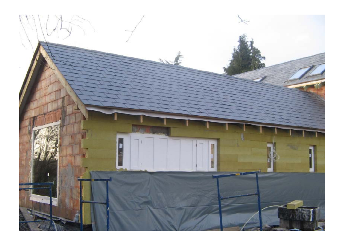
How to achieve air tightness - and why