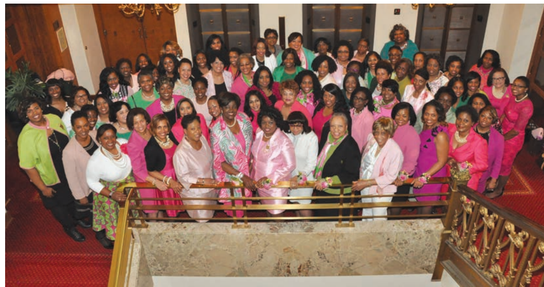
Recently, the Alpha Kappa Alpha Sorority, Inc.-Upsilon Mu Omega Chapter observed and celebrated its 20 years of community service and sisterly love with an anniversary brunch at the Milwaukee Athletic Club, downtown. Here they pose on the stairwell of the club. Earlier, the sorority worshiped together at Christ the King Baptist Church...