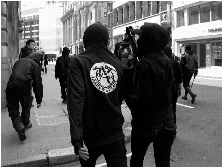
Figure 1. G20 protestors, London 2009: the legacy of the Crass brand in later anti-capitalism.

heart: music recording, production, and distribution, live performance and promotion, recorded sound, film and video experimentation, clothing and style, visual art and design, graffiti and street art, logo design and branding but also subvertising, typography, alternative organization networks, and grassroots touring circuit, lifestyle and domestic arrangements from eating to collective living, fundraising for campaigns, détournements and pranksterism – all of these featured in an ambitious and encompassing extension of DIY practice. Much of this happened from a small group of people living together in a farm on the edge of Epping Forest, Essex, 15 miles from central London. It was a remarkable cottage industry.