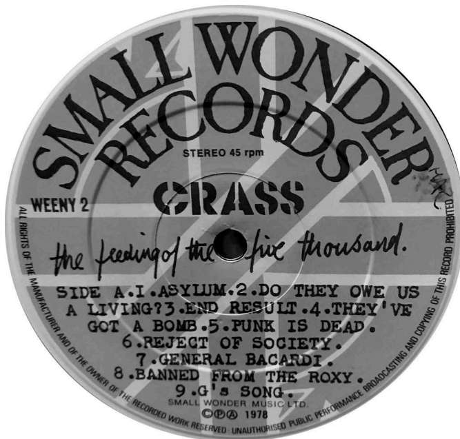
Figure 5. “The music was becoming self-consuming, like the Crass circular tail-eating-head logo” itself (gray background image).