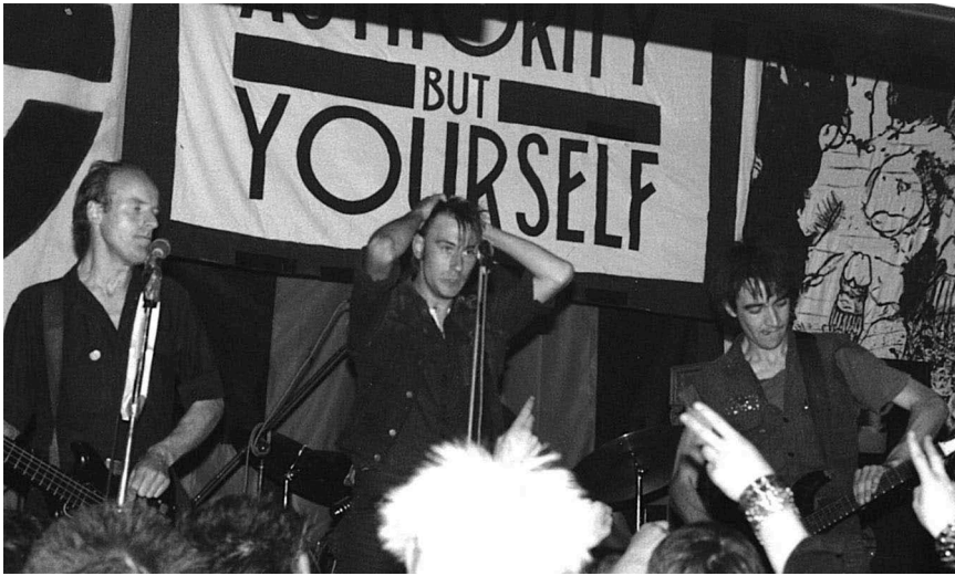
Figure 2. Crass, live 1984. L-R Pete Wright, Steve Ignorant, N.A. Palmer. Black and white, cropped.