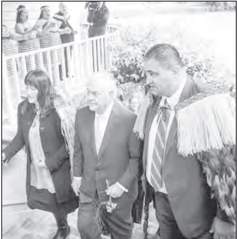
U.S. Secretary of State Rex Tillerson, center, attends a powhiri (maori welcome ceremony) at Premier House in Wellington, New Zealand, Tuesday, June 6, 2017.