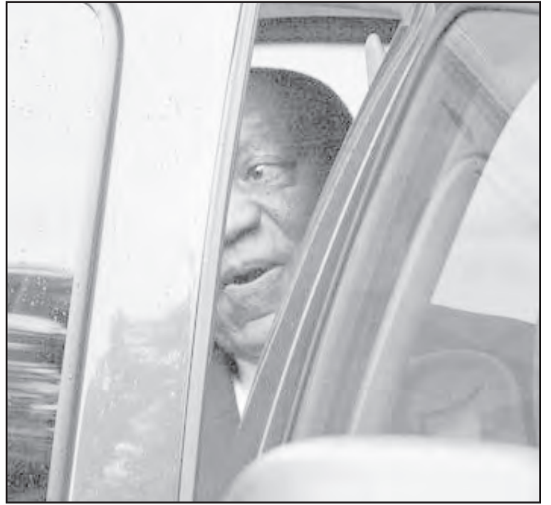
Bill Cosby departs from the Montgomery County Courthouse during his sexual assault trial in Norristown, Pa., Monday, June 5, 2017.