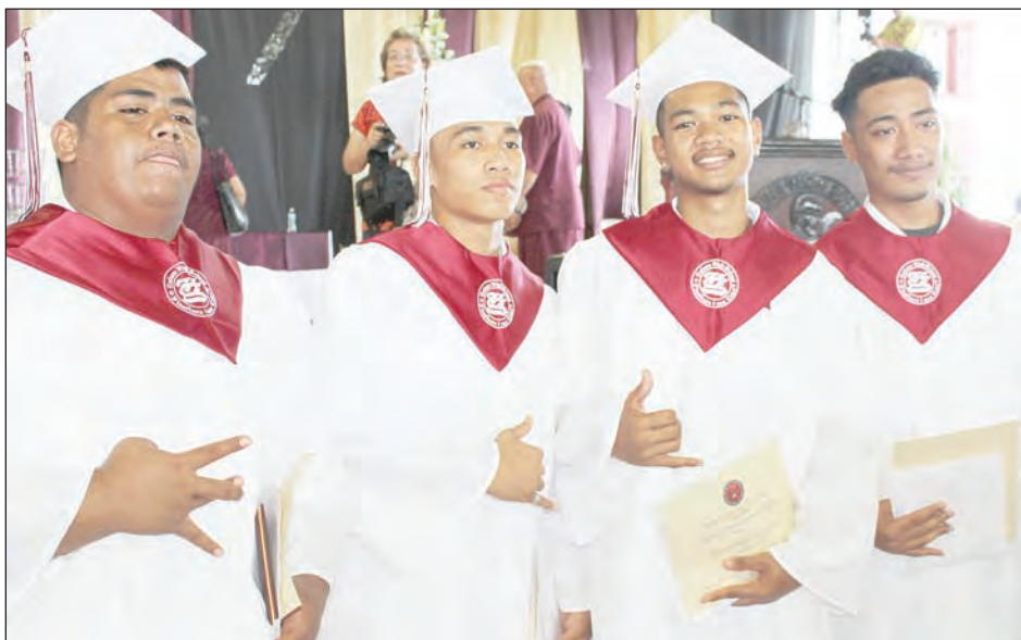
Proud warriors who celebrated their last chapter at Tafuna High School yesterday.