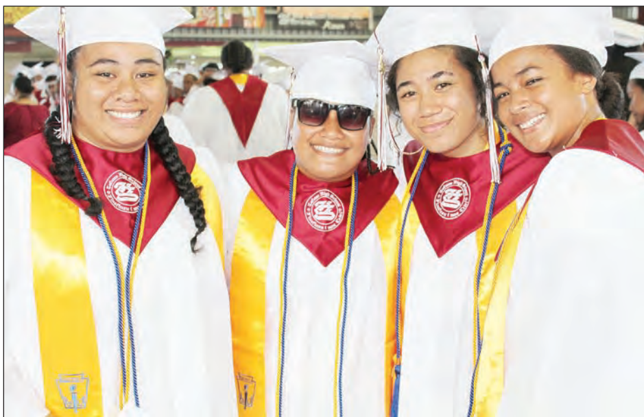
Some of the fellow graduates who continue to smile despite feeling sad at leaving this chapter in their life — high school at the Warrior Nation.