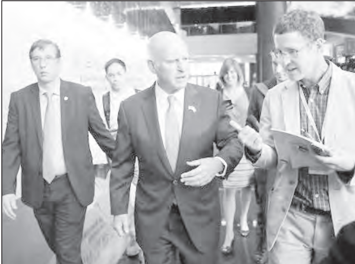
California Gov. Jerry Brown, center, talks with reporters after delivering a speech during the Clean Energy Ministerial International Forum on Electric Vehicle Pilot Cities and Industrial Development, at a hotel in Beijing, Tuesday, June 6, 2017. Brown predicts that President Donald Trump's decision to pull the U.S. out of the Paris climate accord will prove temporary because of the urgency of the issue.