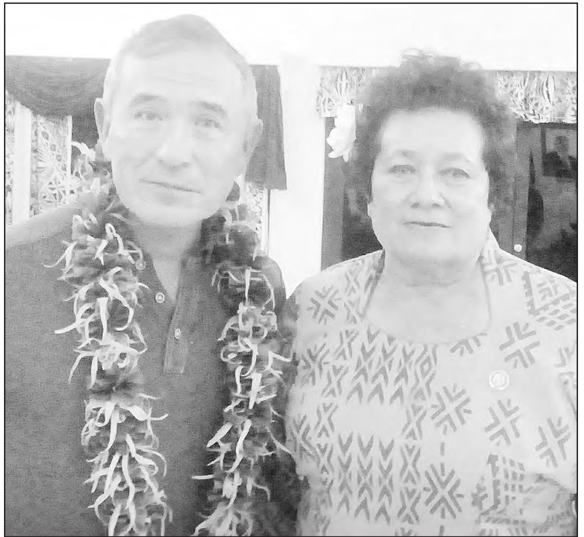
Congresswoman Amata and Pac Com Commander Admiral Harry B. Harris Jr.

FOLLOWS WITH MEETING WITH PAC COM COMMANDER — ADMIRAL HARRIS