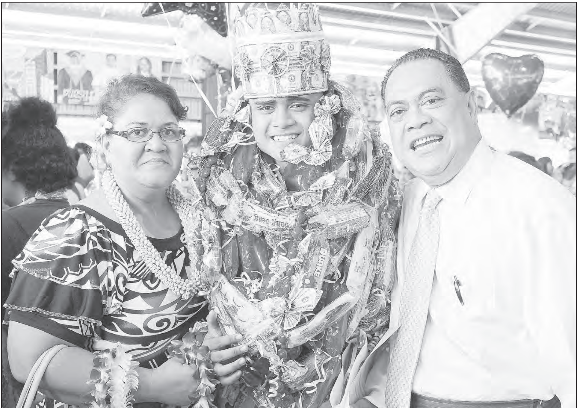
Proud parents with their graduate, Class of 2017 Tafuna “Warriors” High School yesterday morning at the school gymnasium in Tafuna.