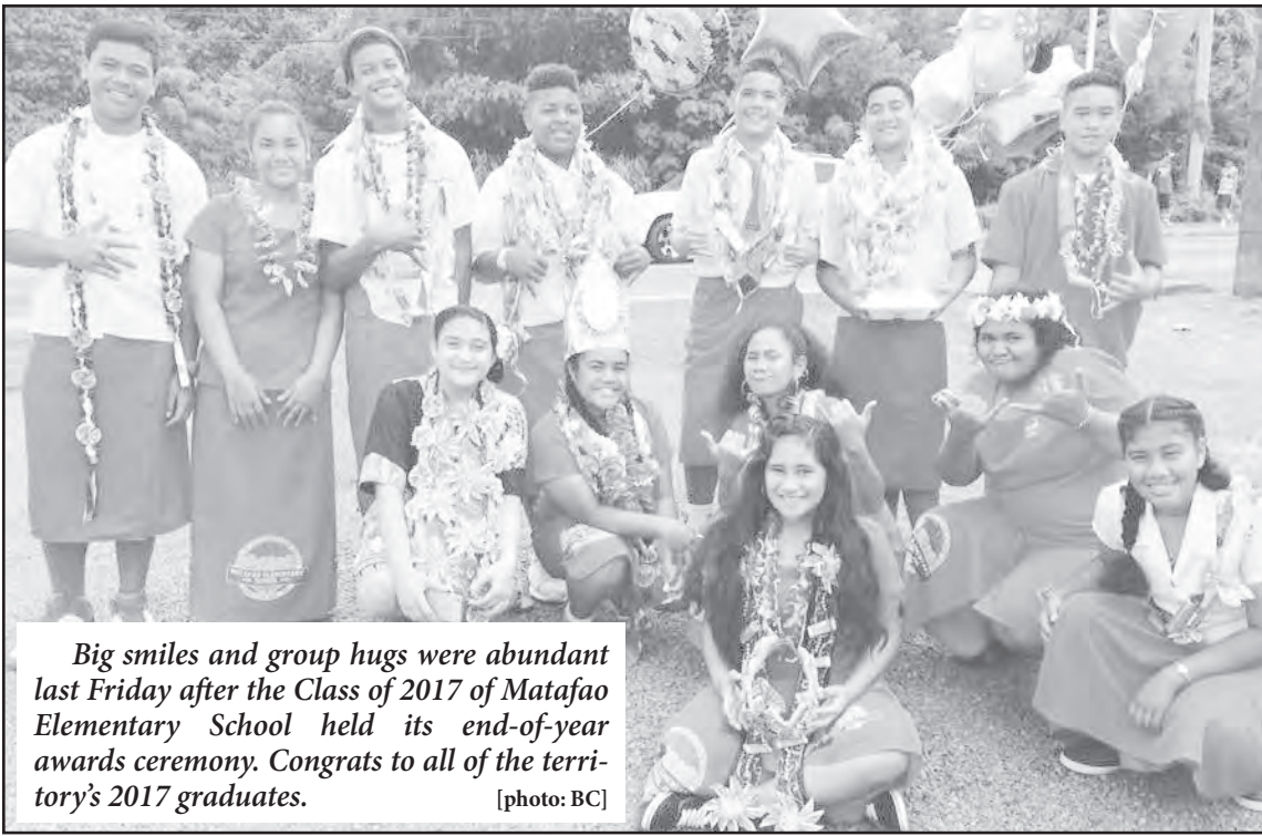
Big smiles and group hugs were abundant last Friday after the Class of 2017 of Matafao Elementary School held its end-of-year awards ceremony. Congrats to all of the territory's 2017 graduates.