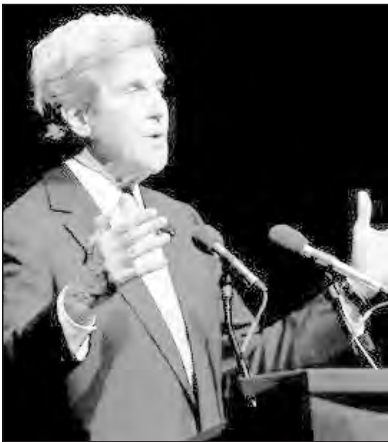
Former Secretary of State John Kerry speaks before the Ploughshares Fund Chain Reaction Gala at Fort Mason in San Francisco, Calif., Monday, June 5, 2017.