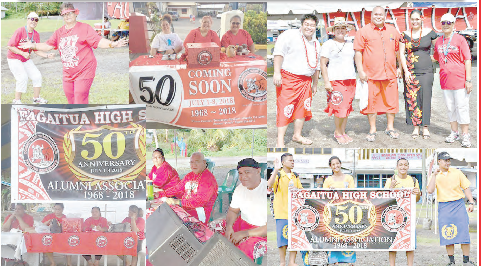
Proceeds to go towards school facility improvement projects for the FHSAA 50th Anniversary, July 1- 8, 2018.