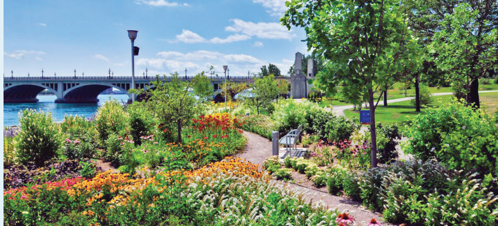
The Detroit riverfront