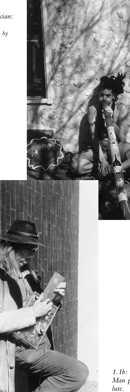
1.1b: Street musician: Man playing electrified lute. (Photo by Lisa McCabe)

1.1a: Street musician: Youth playing didjeridu. (Photo by Lisa McCabe)