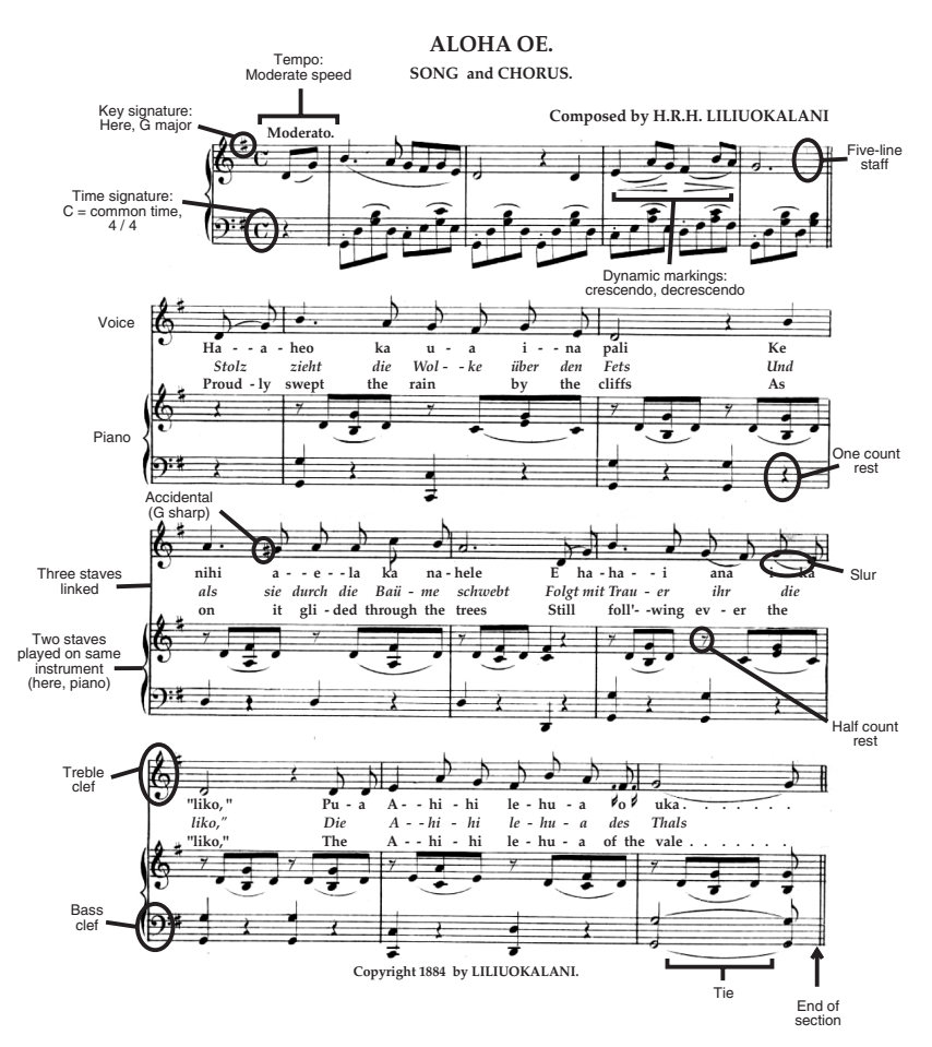
FIGURE 1.12 Western notation through "Aloha Oe." (with the assistance of Joseph Dales)