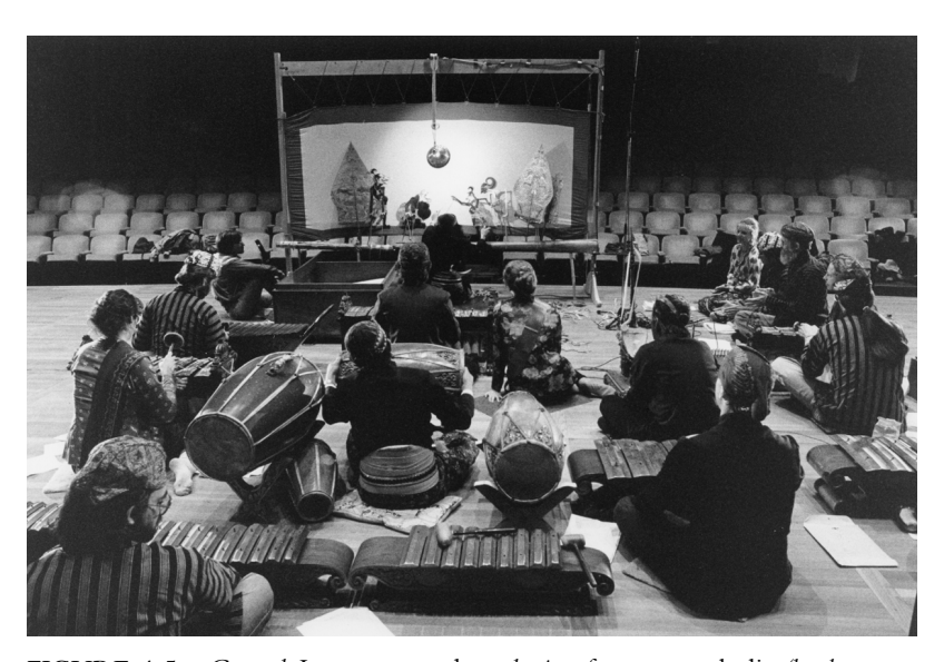
FIGURE 1.5 Central Javanese gamelan playing for wayang kulit (leather puppet play).

We might assume that a sung text is meant to be understood. Not necessarily so! Even when a Central Javanese gamelan (ensemble) includes vocalists, the text they sing may not be immediately intelligible. Not only do their voices blend into the greater ensemble sound, but the poems are usually in old Javanese language that few listeners know (CD track 8; figure 1.5). For the few who can understand, the meaning lies both in the text itself and in the singing of it; for the less knowledgeable, the meaning lies in the recognition that an old text is being sung, in the assurance that tradition continues.