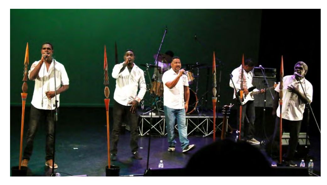
The Dandenong Ranges Music Council acknowledges the generous support of Yarra Ranges Council through a partnership grant