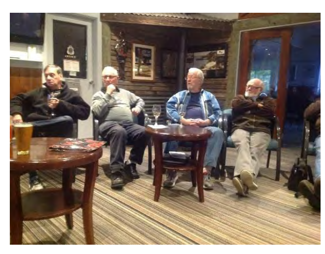
Workshop @ Upwey RSL