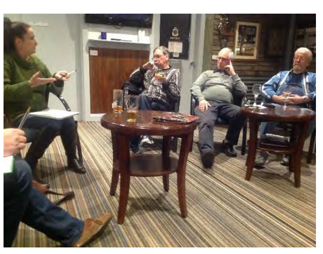
Workshop @ Upwey RSL