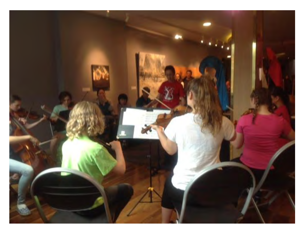
Ranges Young Strings performing at Ranges Music Festival at Burrinja

We have enrolled In the Victorian Composer Project and will have a work written for us to be premiered at a combined concert in August 2019.