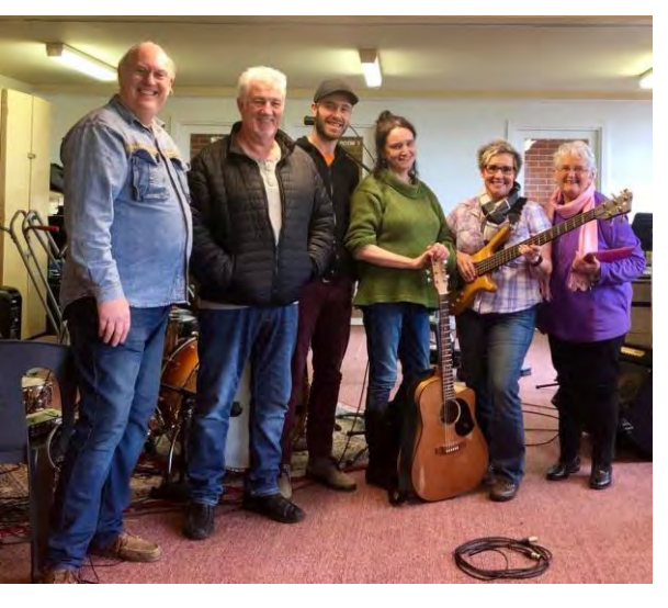
Band Rehearsal @ DRMC