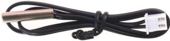
W1209 Temperature Control Switch

This is the basic Manual for using W1209 Temperature control Relay Switch Module