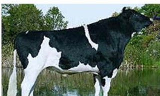
Could be Roumare worth $$$ per dose