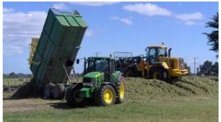
Rolling silage stack