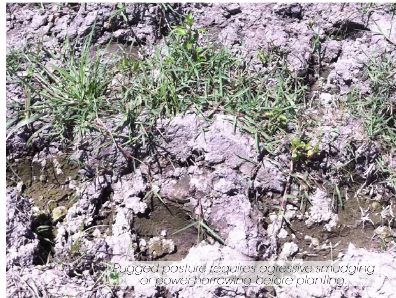
Pugged pasture requires aggressive smudging or power-harrowing before planting.