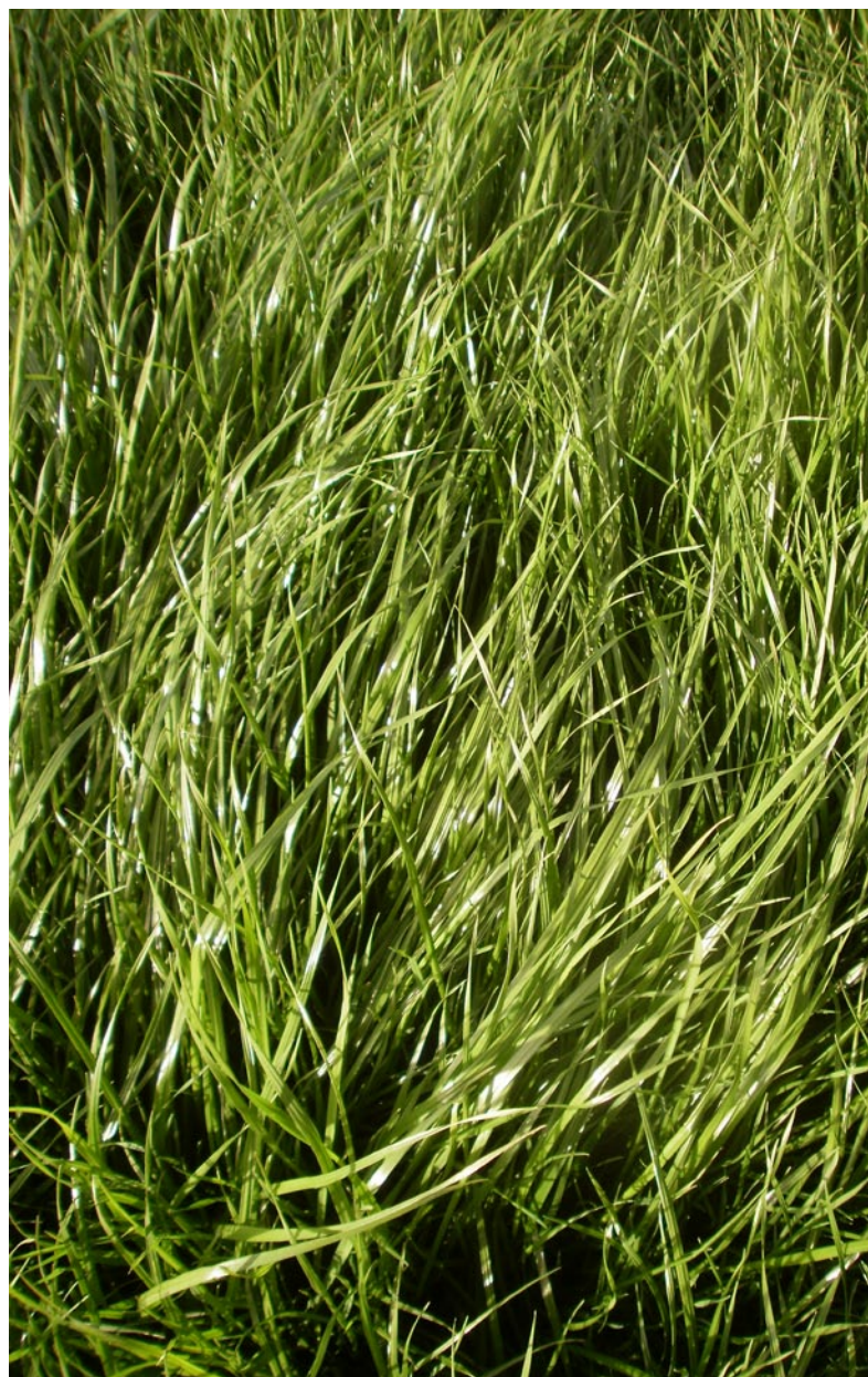
Nitrogen boosted silage (Mega Bite Ultra®)

CONTACT NOTMAN PASTURE SEEDS FOR THIS YEARS LATEST CULTIVARS AND HIGHEST QUALITY PASTURE SEED.