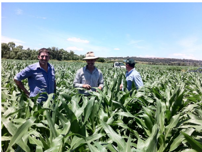
Successful Maize crop, Muswellbrook NSW