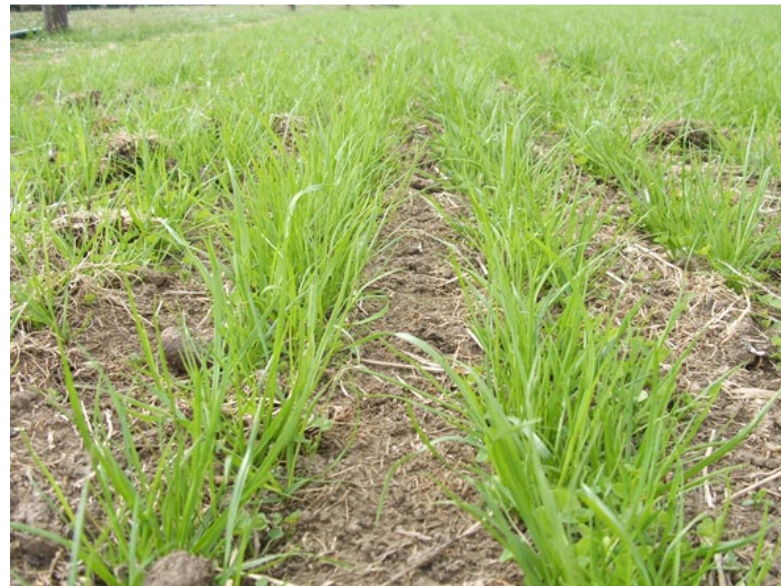
Surge ryegrass showing quick establishment last spring after soils had been pugged.