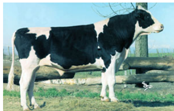
Could be your back paddock bull