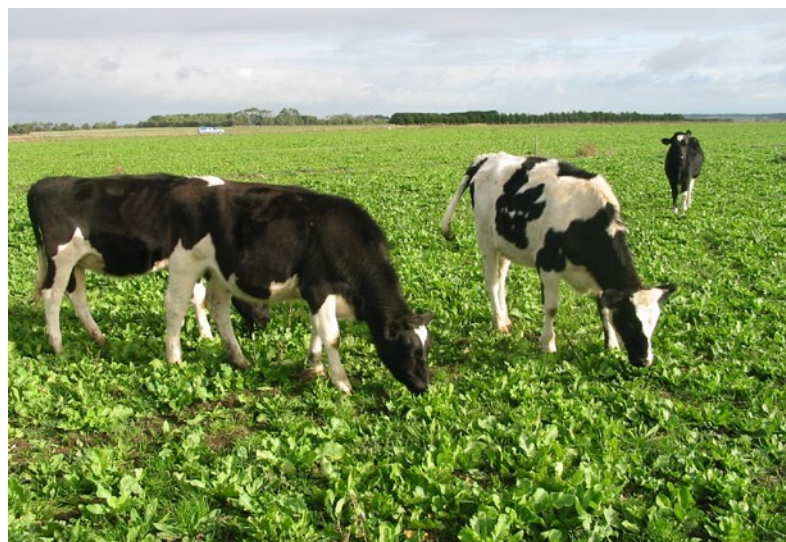
Young stock grazing Chicory, Western Victoria

Chico can be used as a summer crop. The crop has a low amount of pest problems. Stock adapt to this feed quickly, and there are no known animal health problems, it is both high in energy and protein. (12mjme and 18% plus in protein). This is a tap-rooted herb a bit slow to get started but very hardy