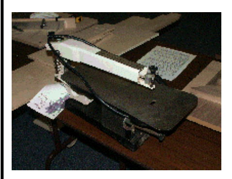
15" Jet Scroll Saw For Sale $70 Eric Lamp – 773-3755