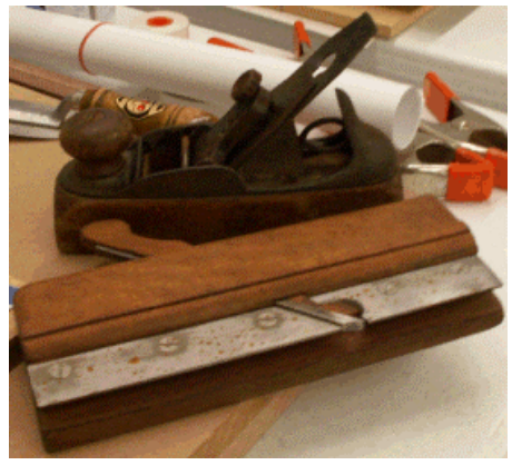
He also brought in an old ice shaver to quiz the members on.

Galen Cassidy showed a rusty plane that he got at a garage sale for $5 and then used electrolysis to remove the rust.