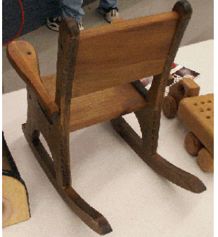
and rocking chair toy as entries to the toy program.

Bernley Asel brought in a beautiful walnut hall / sofa table with curly maple drawer pulls.