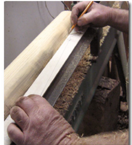
Using template to mark spindle