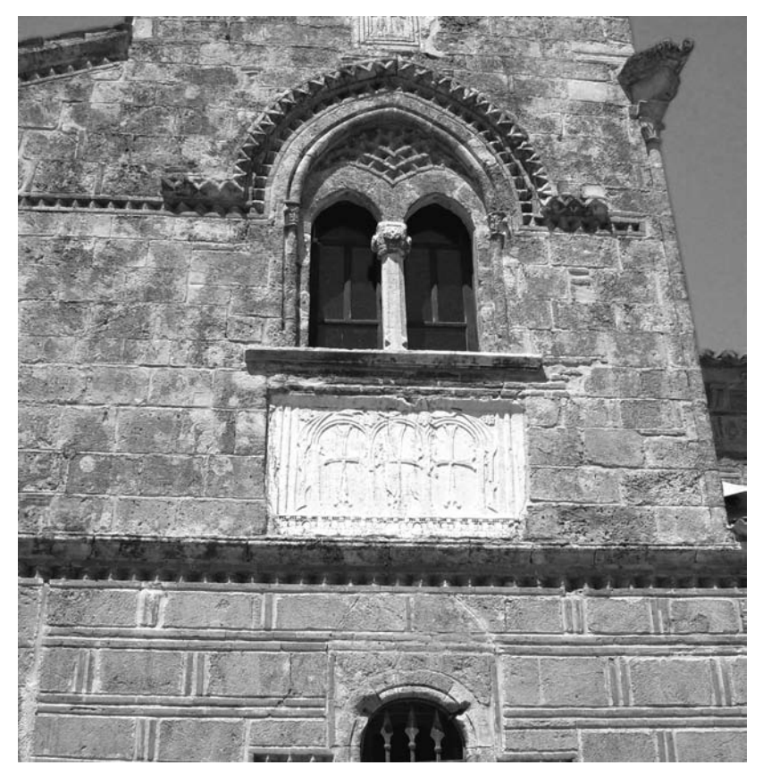
Figure 2 Window on the south wall of the monastery at Vlakherna, near Kyllini in the Peloponnese

the westerners.<sup>88</sup> Outside the religious sphere, the Palace complex at Mistra shows clear western influence, particularly in the oldest wing, which may date back to the brief period of Frankish occupation (Fig. 3).