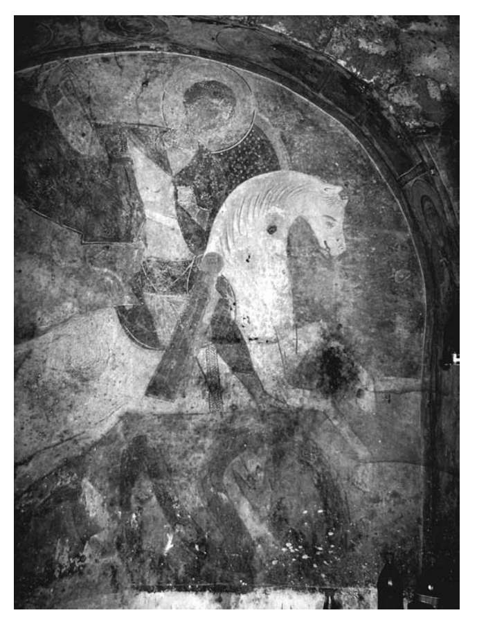
Figure 4 St George, from Agios Nikolaos at Polemitas in the Inner Mani

the characteristic iconography had changed by the end of the thirteenth century under the impact of the Franks. During the Frankish period, military saints appeared in greater quantity and were on average given greater prominence; moreover, the position of the saint changed to reflect western practice. It is argued that this reflects 'appreciation of Frankish chivalric customs and... a certain degree of cultural emulation and symbiosis'.<sup>90</sup> The popularity of St George in such wall-paintings – a fine example is the thirteenth-century fresco of the saint at St Nicholas, Polemitas in the Mani (Fig. 4) – certainly fits well with the respect for the saint as military