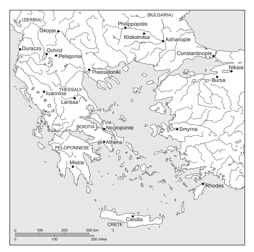
Map 1 The Aegean region