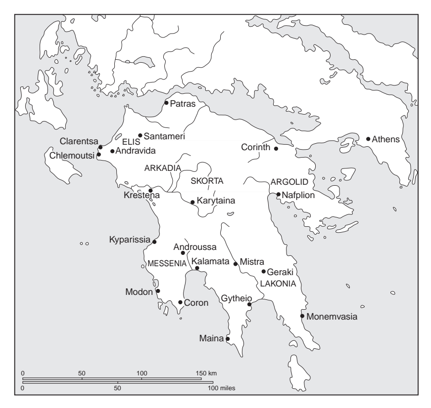
Map 2 The Peloponnese