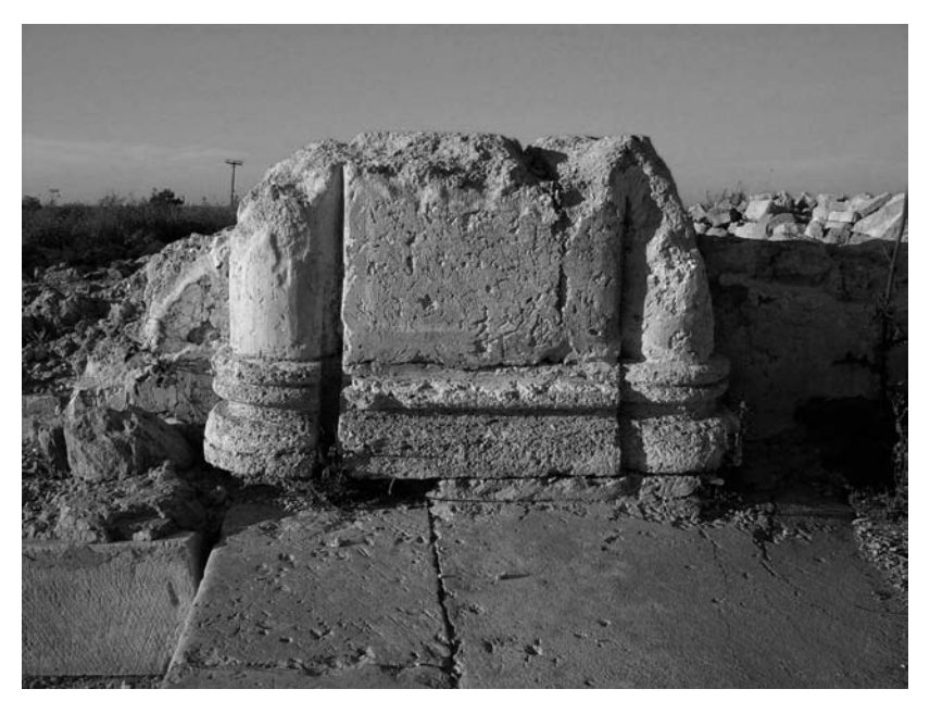
Figure 1 Decorative pillars at the ruined Frankish cathedral, Glarentsa (Kyllini) in the Peloponnese

characterised as Byzantine because they date at least in origin to before the Frankish conquest, or otherwise are typically Byzantine in all barring the Gothic touches.