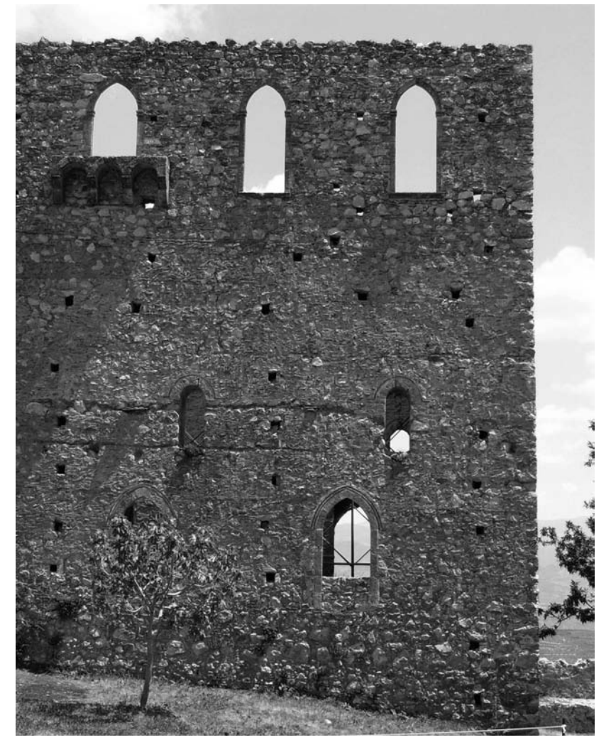
Figure 3 The earliest wing of the despot's palace, Mistra

and thus no indication of true assimilation.<sup>89</sup> Turning to painting, however, there is evidence of a more subtle western influence that is furthermore indicative of an assimilated society.