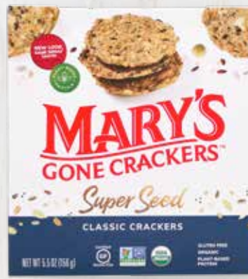
MARY'S® Gone Crackers Assorted Varieties 5-6.5 oz.