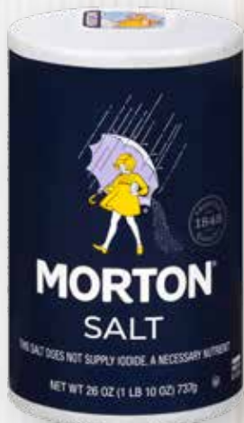
MORTON® Salt Plain or Iodized 26 oz.