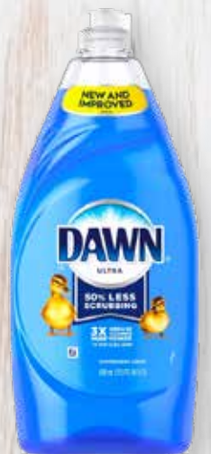
DAWN® Liquid Dish Soap Assorted Varieties 19.4-28 oz.