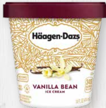
HÄAGEN DAZS® Ice Cream Assorted Varieties 14 oz.