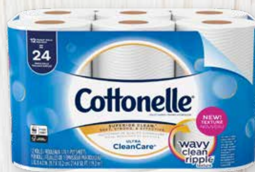
COTTONELLE® Bath Tissue Ultra Comfort or Ultra Clean Care 12 Rolls