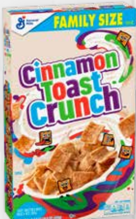
GENERAL MILLS® Cereal Selected Varieties 18-19.7oz.