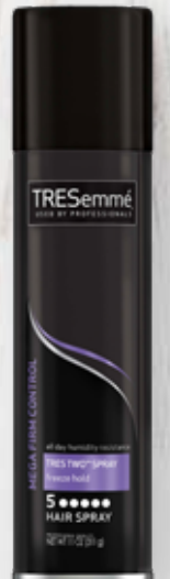
TRESEMME® Hair Spray Assorted Varieties 11oz.