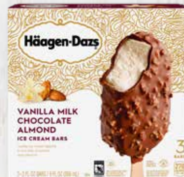
HÄAGEN DAZS® Ice Cream Bars Assorted Varieties 3 Ct.