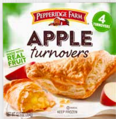
PEPPERIDGE FARM® Turn Overs or Layer Cakes Assorted Varieties 12.5-19.6 oz.