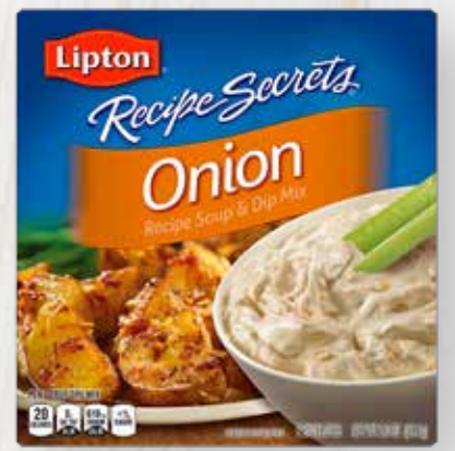
LIPTON® Soup & Dip Mix Assorted Varieties 1.8-4.9 oz.