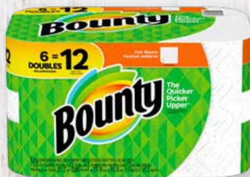
BOUNTY® Paper Towels Full or Select-A-Sheet Double Roll 6 Ct. = 12 Rolls