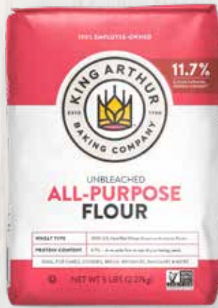
KING ARTHUR® Flour All Purpose 5 lbs.