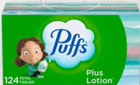
PUFFS® Facial Tissue Selected Varieties 124 Ct.