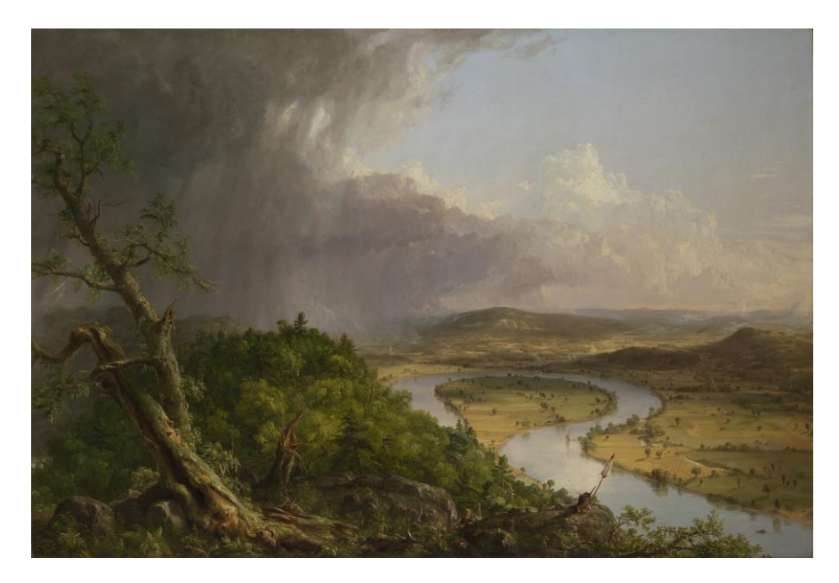
Fig. 1. Thomas Cole, View from Mount Holyoke, Northampton, Massachusetts, after a Thunderstorm—The Oxbow , 1836. Oil on canvas, 51 1/2 x 76 in. The Metropolitan Museum of Art, New York, Gift of Mrs. Russell Sage, 1908

By dividing the works by Cole and related artists into seven distinct themes that include Industrial England, American Wilderness, London, Italy, Course of Empire, Cole's Manifesto, and Cole's Legacy, the curators argue that Cole's oeuvre is a product of his biographical and artistic connection to Europe, especially England. Moreover, it is Cole's early contact with the tensions and controversies related to industrialization in England that defined his approach to art making. This becomes apparent in the artist's critique of industry's encroachment on the untainted American landscape, in which Cole became interested after immigrating to the United States in 1818. Following in the footsteps of several art historians who have written about Cole, such as Angela Miller and Alan Wallach, the curators contend that Cole was both suspicious of and angry about the ways in which political greed and industrial ambition intruded upon a once-innocent pastoral ideal.¹