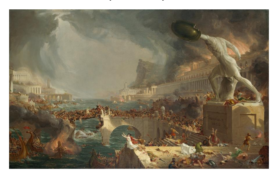
Fig. 3. Thomas Cole, The Course of Empire: Destruction , 1836. Oil on canvas, 39 1/4 \times 63 \times 1/2 in. New-York Historical Society, Gift of the New-York Gallery of the Fine Arts; © Collection of the New-York Historical Society, New York/Digital image created by Oppenheimer Editions

Cole grounds our sight with a rock formation that stays consistent in each composition, but the figures and visual tropes change. The population goes from uncivilized to idyllic to sybaritic to decimated to vanished in five spectacular beats. The wall text for each of the five paintings, which include The Savage State , The Arcadian or Pastoral State , The Consummation of Empire (fig. 8), Destruction (fig. 9), and Desolation , furthers the contention that Cole abhorred the direction of American civilization and used these paintings as a didactic tale about unchecked progress and Jacksonian expansion. As the wall text for Destruction contends, "As a result of its own moral failings, the empire is falling. Beneath an enormous Roman gladiator, the innocent are being butchered, and the achievements of civilisation destroyed." Cole renders the violence that led to the ruins he celebrated in his Italian paintings of the early 1830s. By placing this section of the exhibition after the Italy portion, the curators help the visitor make visual connections between actual ruins and Cole's contention about the cycle of history.