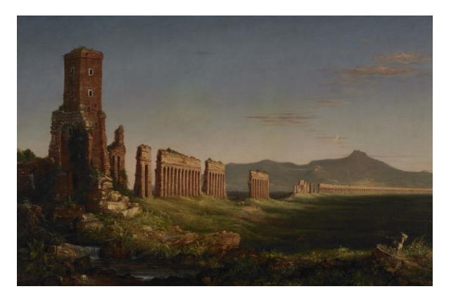
Fig. 7. Thomas Cole, Aqueduct near Rome, 1832. Oil on canvas, 45 x 68 1/8 in. Mildred Lane Kemper Art Museum, Washington University in St. Louis, University purchase, Bixby Fund, by exchange, 1987

It is in the fifth section of this exhibition, which focuses on the five-part cycle The Course of Empire (1833–36; New-York Historical Society, New York), where the