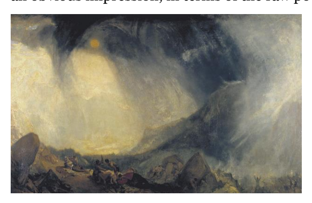
Fig.6. Joseph Mallord William Turner, Snow Storm: Hannibal and His Army Crossing the Alps , exhibited 1812. Oil on canvas, 57 1/2 x 93 1/2 in. Tate Britain, London, Accepted by the nation as part of the Turner Bequest 1856; © Tate, London 2017

While these early paintings of the wilderness offer a clear connection to European painters Cole admired, it was during his return to Europe in the late 1820s and early 1830s, when he spent time in England and Italy, that his fascination with European precedent became more pronounced. The third and fourth sections of the show, London and Italy, convincingly emphasize Cole's obvious study of Turner, Claude Lorrain (1604/5–1682), and John Constable. Seeing Turner's Snow Storm: Hannibal and His Army Crossing the Alps (exhibited 1812; fig. 6) in the same exhibition as Cole's The Oxbow (1836; fig. 1) makes it evident that the time Cole spent in Turner's well-respected private gallery in 1829 created an obvious impression, in terms of the raw power of nature that Turner captured as well as