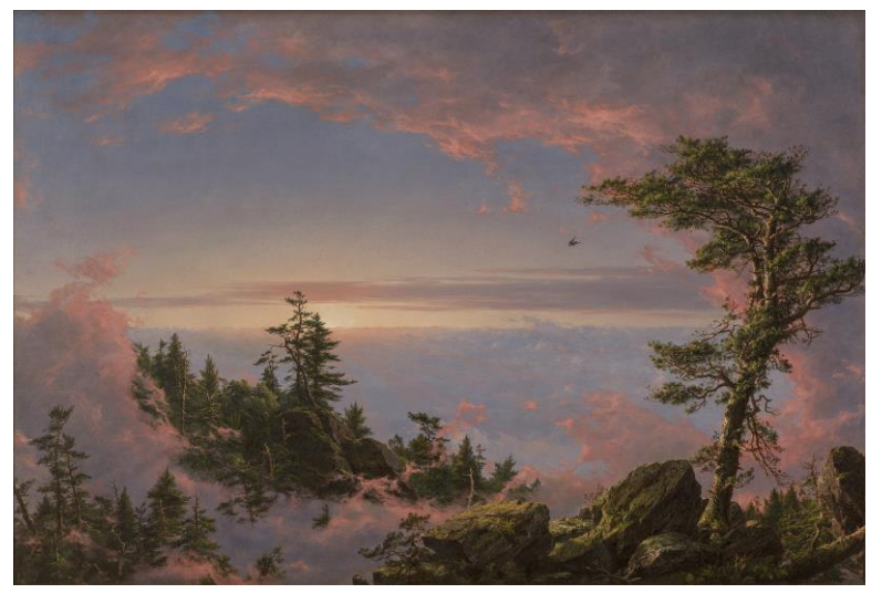
Figs.10, 11. Left: Asher Brown Durand, Kindred Spirits , 1849. Oil on canvas, 44 x 36 in. Crystal Bridges Museum of American Art, Bentonville, Arkansas; © Crystal Bridges Museum of American Art/ Photography by The Metropolitan Museum of Art. Right: Frederic Edwin Church, Above the Clouds at Sunrise , 1849. Oil on canvas, 27 1/4 x 40 1/4 in. Private collection; © Private collection

Yet beyond the nineteenth century, the National Gallery pushes Cole's legacy into the realm of the contemporary in a location the museum calls "Room 1," a space some distance from the Cole show, yet right next to the Trafalgar Square entrance to the museum. Here visitors can view the Edward Ruscha (b. 1937) exhibition, Ed Ruscha: Course of Empire , an artistic and curatorial response to the Cole exhibition. Room 1 includes ten paintings by Ruscha, five black-and-white works from 1992 and five colorful paintings from 2003 and later of the