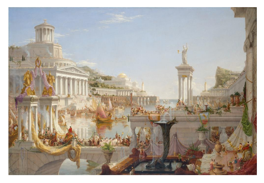
Fig. 8. Thomas Cole, The Course of Empire: The Consummation of Empire , 1835–36. Oil on canvas, 51\,1/4\,x\,76 in. New-York Historical Society, Gift of the New-York Gallery of the Fine Arts; © Collection of the New-York Historical Society, New York/Digital image created by Oppenheimer Editions

curators home in on their central argument about Cole's disillusionment with the American political scene and its concomitant disregard for what had been an Edenic landscape. After returning to the United States in November of 1832, Cole received a commission from New York entrepreneur Luman Reed (1787–1836) to complete these five works. The wall text for this section notes, " The Course of Empire is a moral fable in which progress and civilization are undermined by man's greed and innate aggression. Human progress is inevitably self-destructive, and the natural world eventually prevails. Cole was issuing a clear warning to modern America." The Course of Empire offers a lucid narrative, as our eyes move through the cycle, watching the rise and fall of civilization from a nineteenth-century perspective.