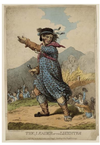
Figs. 2, 3. Left: Joseph Mallord William Turner, Leeds, 1816. Watercolor, scraping out and pen and black ink on medium, slightly textured, cream wove paper, 11 1/2 x 17 in. Yale Center for British Art, New Haven, Paul Mellon Collection; © Yale Center for British Art, New Haven. Right: Unknown artist, The Leader of the Luddites, 1812. Hand-colored etching, 12 3/4 x 8 7/8 in. British Museum, London, Purchased from Andrew Edmunds; © The Trustees of the British Museum. All rights reserved