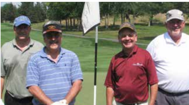
Team Dime Bank

Superior East (Superior Products Distributors, Inc.) The Nutmeg Companies, Inc. Telaid Industries, Inc. Tobin, Carberry, O'Malley, Riley, Selinger, P.C. (TCORS) Voc's Westside Pizza Waterford Group Charitable Foundation