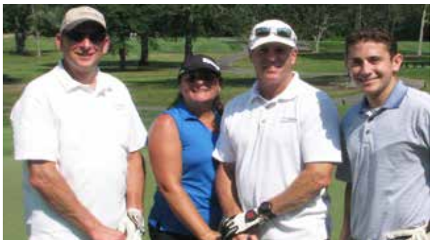
Team American Ambulance