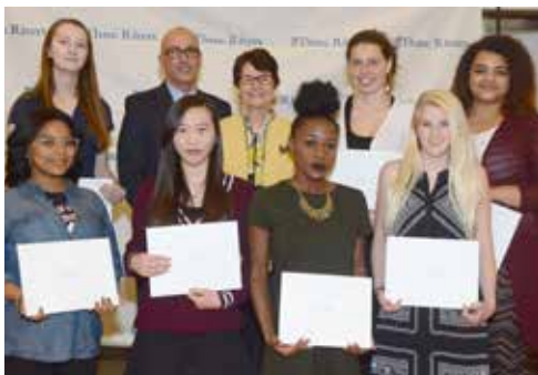
Liberty Bank Scholarship recipients