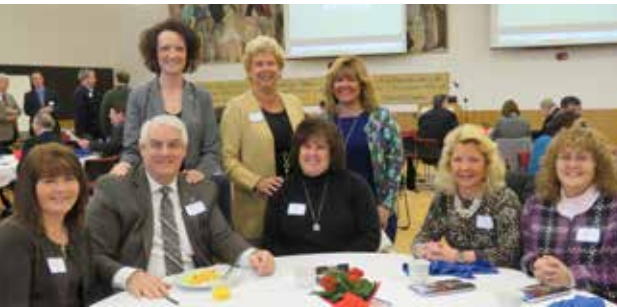
Chelsea Groton Bank