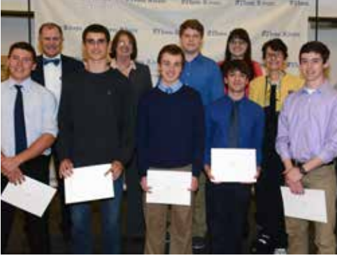
Dominion Nuclear/Millstone Scholarship Recipients