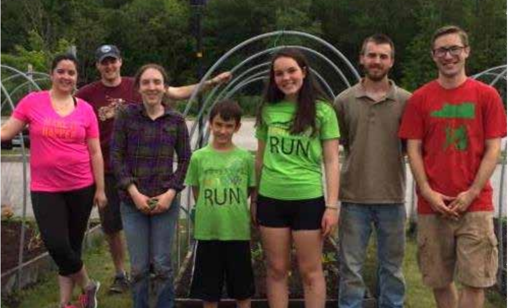
Volunteers helping for the day

Thanks to the support of the Heidenreich Family Foundation, $1,500 dollars was provided for the installation of a waterline so that students could water the rain garden and the vegetable gardens!