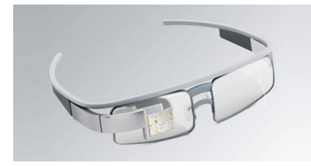
Figure 5. Augmented reality monocular eyewear

Augmented reality eyewear; Another opportunity to experience the right information at the right time is to use augmented reality eyewear. Go to <u>TI.com/DLPAR</u> to learn more about this implementation; Figure 5.