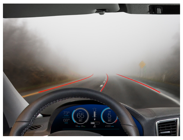
Figure 3. Aftermarket head-up display used to help see road ahead

within the user's FOV. The HUD could be used to highlight obstacles ahead even with low visibility given high fog coverage ( Figure 3 ).