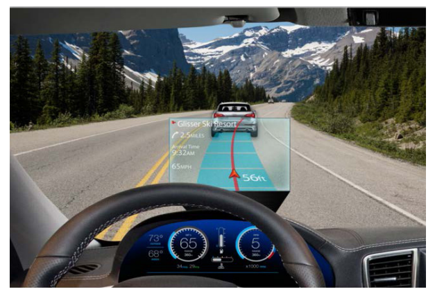
Figure 4. Aftermarket head-up display

Aftermarket head-up display (AM-HUD); Similar to an aftermarket car stereo that is sold by a retailer, an AM-HUD is a portable device that is placed on a car dashboard or front visor so that the driver can see the road and, within a portion of their FOV, enjoy timely information delivered by the AM-HUD (Figure 4).