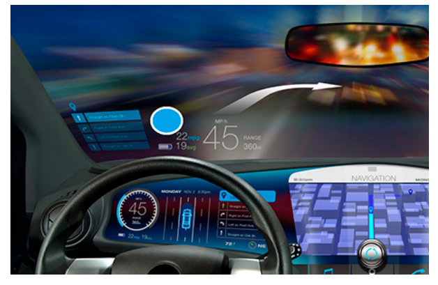
Figure 2. Head-up display indicating a right turn during navigation

Where needed; With an integrated camera, the HUD display could augment the information such that the information on the HUD could be spatially placed on/over real objects that are