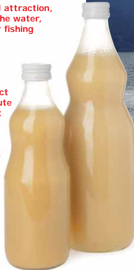
Packaging 500 ml & 1.000 ml. glass bottles