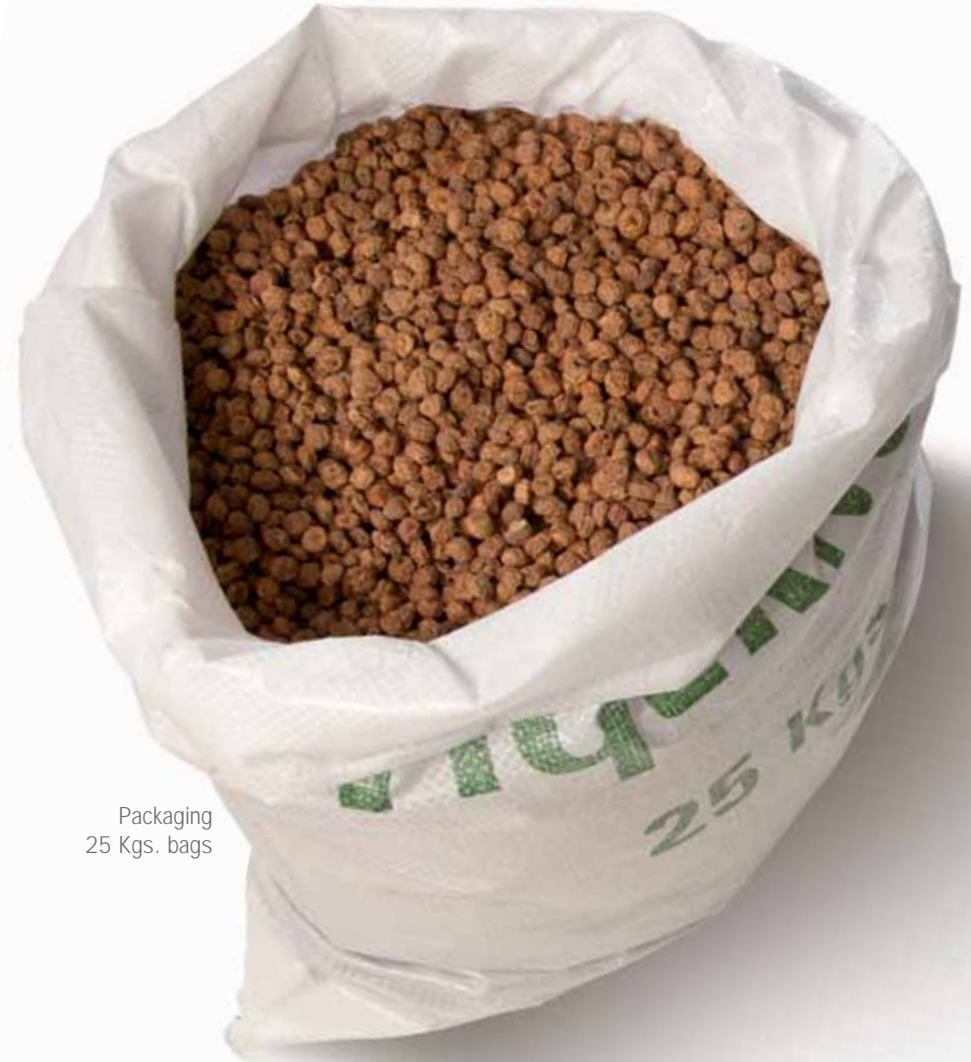
Packaging 25 Kgs. bags

Tigernuts are a recommended product for being used all season, but its efficiency increases as the climate becomes warmer.