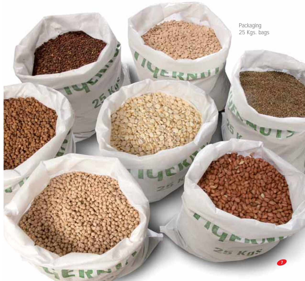
Packaging 25 Kgs. bags

Just like the maize or chickpeas, maple peas make an instant bait. One of the most usual mistakes is to use too many grains for fishing, which limites the catches. Probably this is the reason why the maple peas have been forgotten by anglers, but even like this, they are still an excellent grain. It's size is about 7mm diameter.