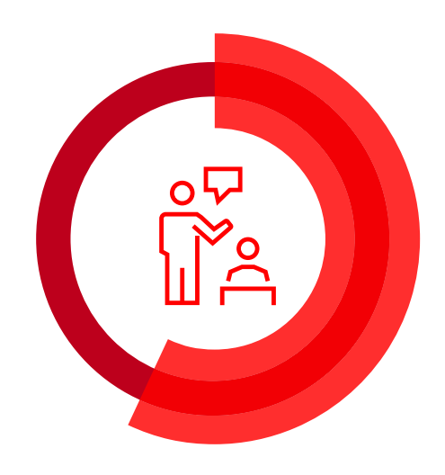
57% OF PEOPLE ARE WILLING TO PROVIDE PERSONAL DATA IN RETURN FOR ADDED BENEFITS.

Spoiled by these experiences, middle market consumers also want them from insurers in tailored product offerings, insurance product reviews and fact-based recommendations. But even with digital technologies at their fingertips, insurers are not interacting with consumers at the right time with the right products on their terms.