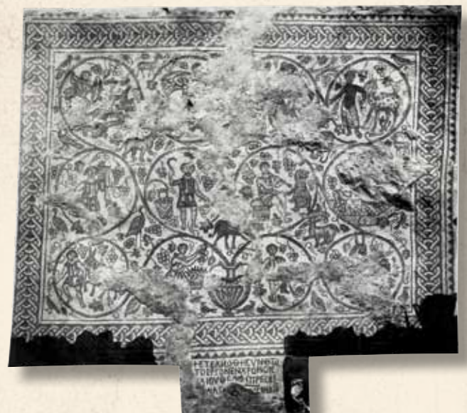
The mosaic in Hall L displays an inhabited vine scroll motif. This composition is common in both Arabia and Palestine in the 6th century, and was perhaps meant to offer a pavement version of an overhead pergola. UPM Image #30096.

Israeli Antiquities Authority (top), Penn Museum (bottom)