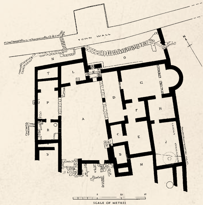
Above, a photographic montage prepared by the excavators shows the positions of the mosaic floors in plan. Right, this small (1600 m 2 ) cenobitic, or communal, monastery is valuable as an example of an urban monastic foundation, a category for which archaeological evidence is scant. The monastery is named not after the Biblical Mary, but after its aristocratic founder, whose name is known to us from inscriptions at the site. Plate II from G. Fitzgerald, 1939.