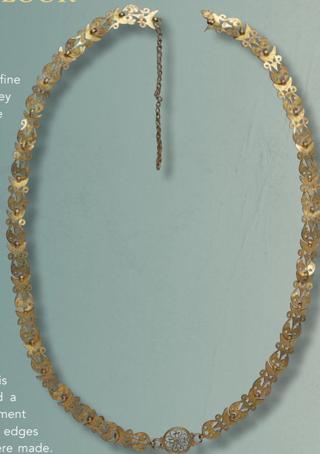
The gold necklace recovered from the floor level of Room H is a fine example of Byzantine pierced work. UPM Object #31-50-212.