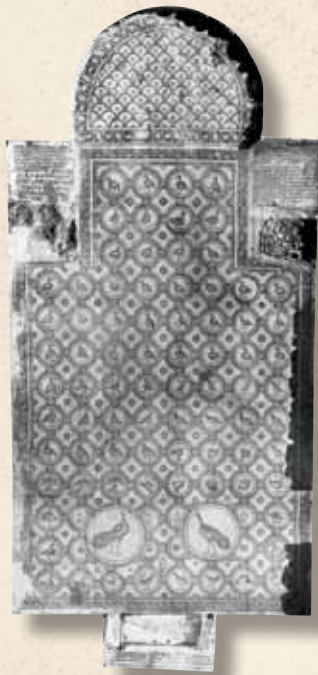
Above, the entrance to the chapel shows a pair of facing peacocks. Because they were believed to have immortal flesh, and shed their feathers every year only to regrow them in the spring, they were seen as an allegory of resurrection and are common in early church decoration. UPM Image #30029. Left, the floor of the chapel is paved with a carpet of birds. Inscriptions at the eastern corners of the chapel indicate the locations of burials. UPM Image #30095.

depiction is surprising. It seems the presence of the sun and moon personifications in a Christian context may be influenced by the appearance of Helios in Jewish zodiac pavements. While scholars have identified Christian motifs borrowed in Jewish contexts, this mosaic may demonstrate a more even-sided exchange, and certainly suggests that in the diverse metropolis of Beth Shean, the same workshops were employed by patrons of all religious inclinations.