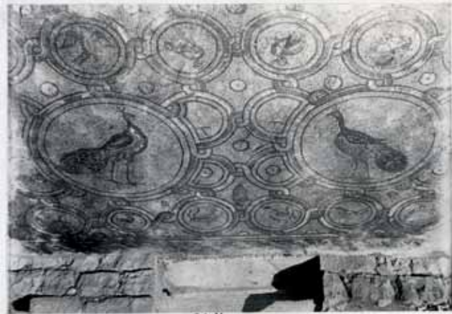
Monastery above the Cemetery - Mosaic with Peacocks in the Chapel near the W. Door. H 70.