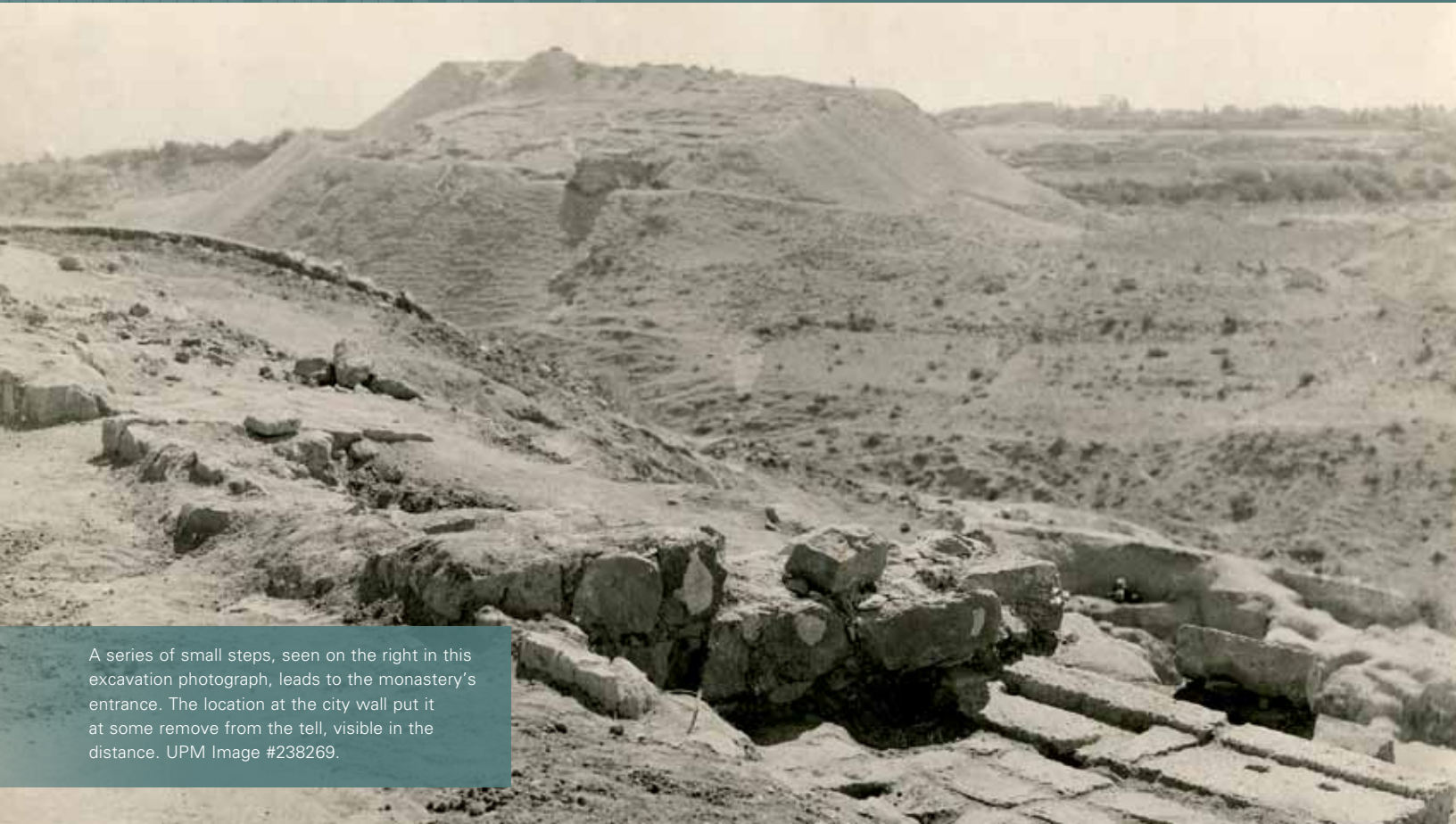
A series of small steps, seen on the right in this excavation photograph, leads to the monastery's entrance. The location at the city wall put it at some remove from the tell, visible in the distance. UPM Image #238269.

Late Antique Beth Shean provides ample evidence of a religiously heterogeneous population. Even as Christianity was becoming established as the dominant faith, we find traces of cultural and artistic exchanges with other religious groups. The floor mosaics of a 6th century monastery find their best comparisons with synagogue pavements, raising the possibility that the same artisans may have worked for both Christian and Jewish patrons.