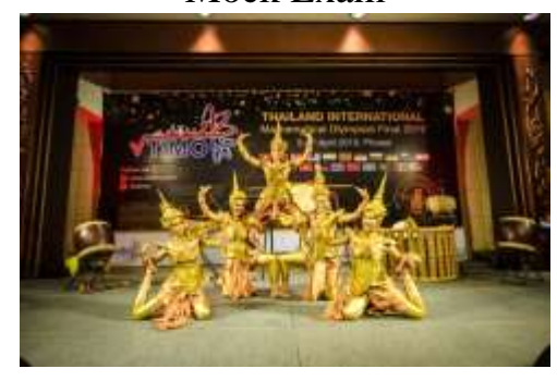
Welcome Dinner Show