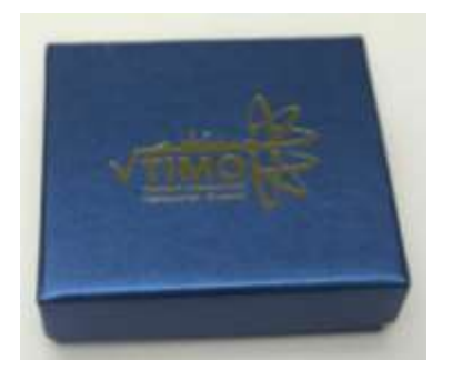
Medal Case Box