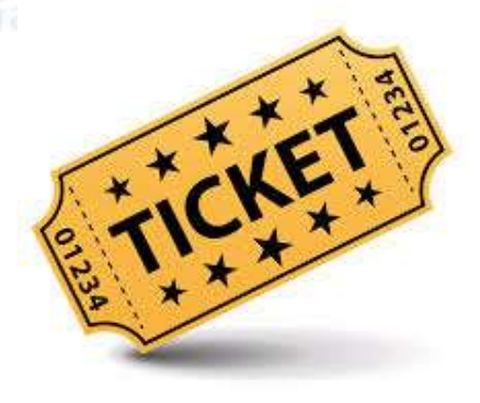
Free Ticket for Free & Easy Package to TIMO Final 2021