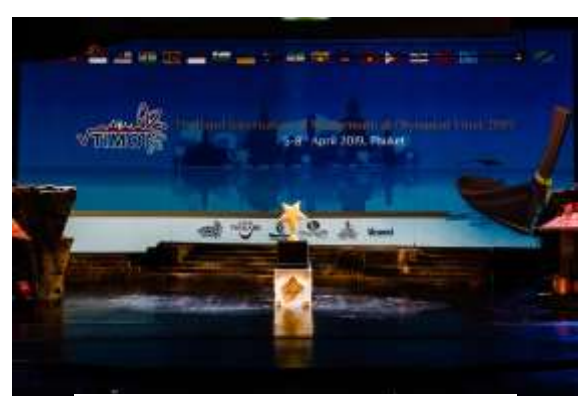
Special World Star offered by Siam Niramit Phuket