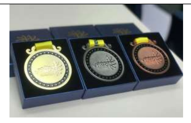
Medal --- Gold / Silver / Bronze