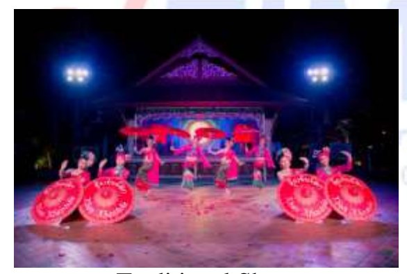
Traditional Show Khum Khantoke