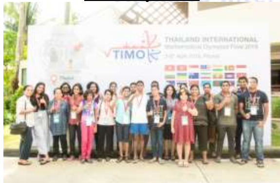
Team Sri Lanka