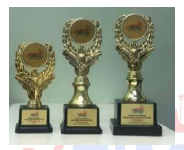
Champion 1<sup>st</sup> Runner-up 2<sup>nd</sup> Runner-up