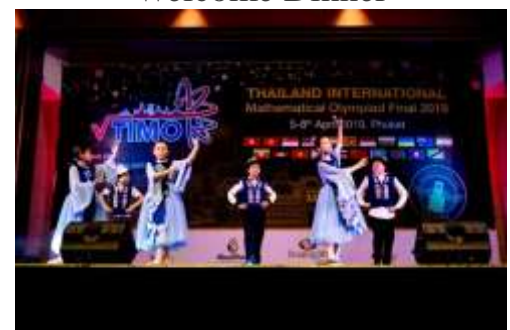
Cultural Show by Team Kyrgyzstan