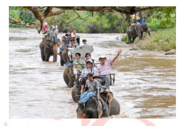
Attractions Elephant Park