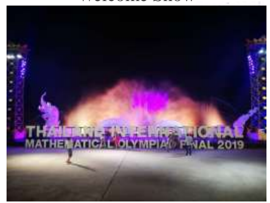
TIMO Logo located at the entrance of Siam Niramit Phuket