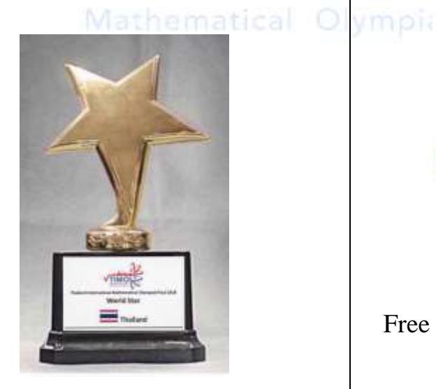
World Star Trophy