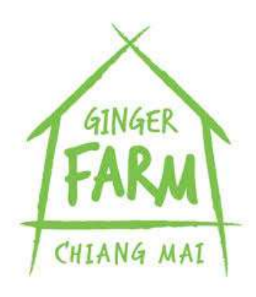
Exploration Ginger Farm Chiang Mai