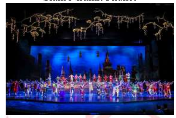
Closing show by Siam Niramit Phuket