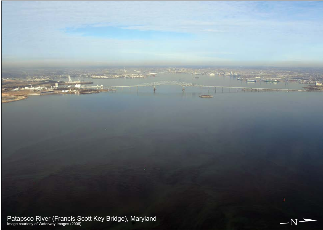
Patapsco River (Francis Scott Key Bridge), Maryland

which, though primarily designed for private industrial purposes, are available in case of need.