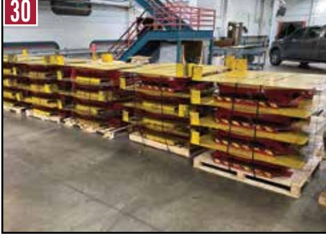
(30) SOUTHWORTH Scissor Lift Tables