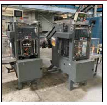
(2) HEIDELBERG HARRIS 17" Rima RS-3010S Stackers