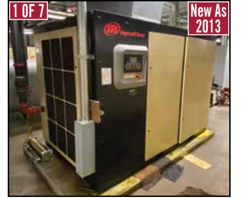
(7) INGERSOLL-RAND Air Compressors to 200-HP & Dryers