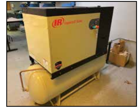
INGERSOLL-RAND IRN15H-CC-115-H Air Compressor

(2) INGERSOLL-RAND SSR-EPE200-25 200-HP Air Compressors