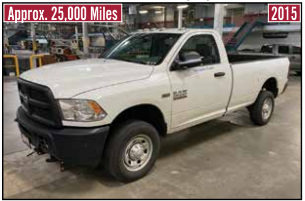
DODGE Ram 2500 Pickup Truck