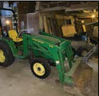
JOHN DEERE 440 Tractor

Over (100) Sections of SCHUR PACK-AGING SYSTEMS ABC440 Powered Conveyor