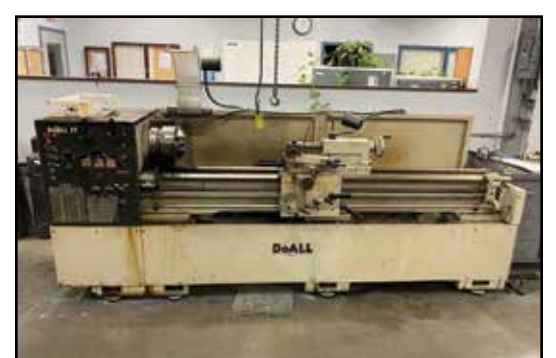
DOALL 17" x 9' Engine Lathe