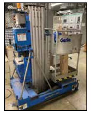
GENIE GS-1939 Scissor Lift