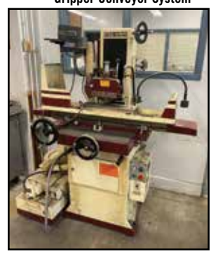
CHEVALIER FSG-618M Surface Grinder