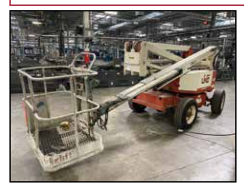
UNO 41E Snorkel Lift Boom Lift

(15) YALE, CATERPILLAR, CLARK, MITSUBISHI & JUNGHEINRICH Forklifts to 15,000-lb. Capacity