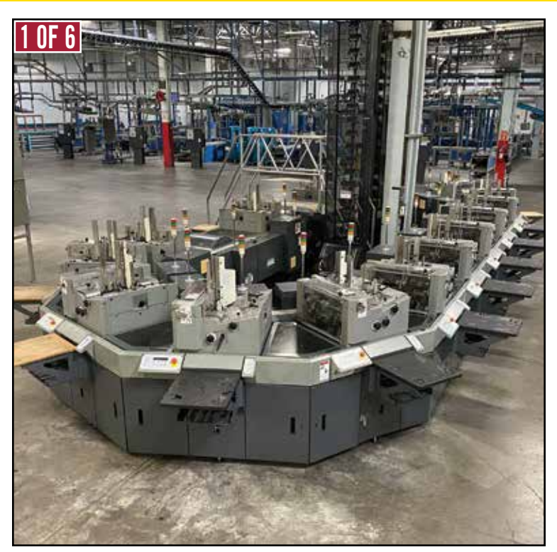
(6) HEIDELBERG 42-, 29- & 16-Bucket Inserters

(4) TKS M-72 11-Unit Offset Printing Presses