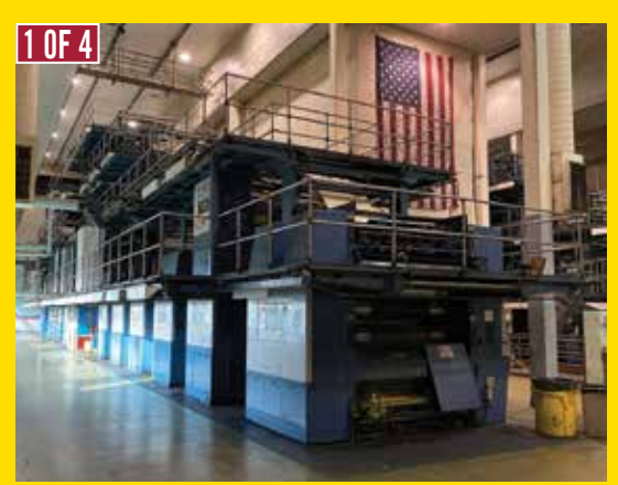
(4) TKS M-72 11-Unit Offset Printing Presses

WEBCAST ONLY - NO ONSITE BIDDING THURSDAY, MARCH 4TH Starting at 10AM ET Inspection: March 2nd & 3rd from 9AM-4PM