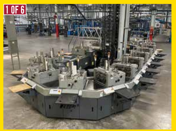
(6) HEIDELBERG 42-, 29- & 16-Bucket Inserters

Auction conducted by: MYRON BOWLING AUCTIONEERS, INC. P. O. Box 369, Ross, Ohio 45061