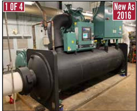
(4) YORK Chillers to 600-Ton Capacity