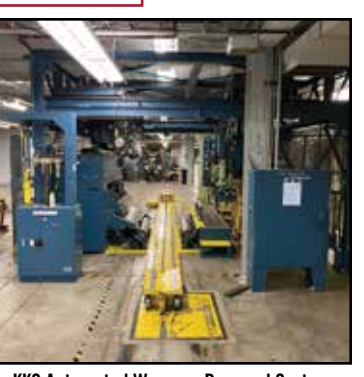
KKS Automated Wrapper Removal System