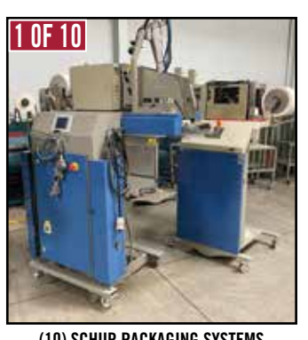
(10) SCHUR PACKAGING SYSTEMS A668 Bundle Labeling Units

2012 KRAUSE Blue Fin XS Processor 2012 NELA VCP1670 Plate Bender / Punch Assorted NELA Transfer Conveyors Assorted NELA Transfer Conveyors New Plate Making Consumables: (8) New Cases of AGFA N95-VCF Digital Photopoly-mer Plates, (6) New Pallets of AGFA Violet CF Gum-HP 20-Liter Containers, (2) New Cases of FUJI FILM LP-NNV Plates, Skid of New FUJI FILM FN-6 Plate Finisher, C) HEIDE REFOC HARPIEL 177 Pime PS (2) HEIDELBERG HARRIS 17" Rima RS-3010S Stackers