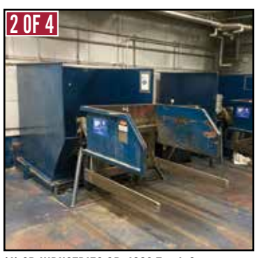
(4) SP INDUSTRIES CP-4002 Trash Compactors