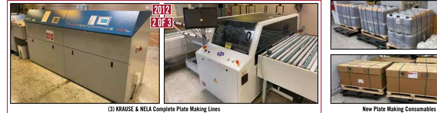
(3) KRAUSE & NELA Complete Plate Making Lines

(4) TKS M-72 11-Unit Offset Printing Presses