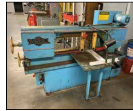
DOALL C-916M Horizontal Band Saw