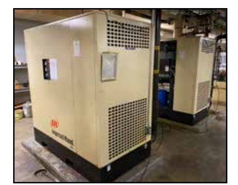
(2) INGERSOLL-RAND TMS2000 Air Dryers

INGERSOLL-RAND IRN100JCC 100-HP Air Compressor