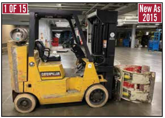
(15) YALE, CATERPILLAR, CLARK, MITSUBISHI & JUNGHEINRICH Forklifts to 15,000-lb. Capacity