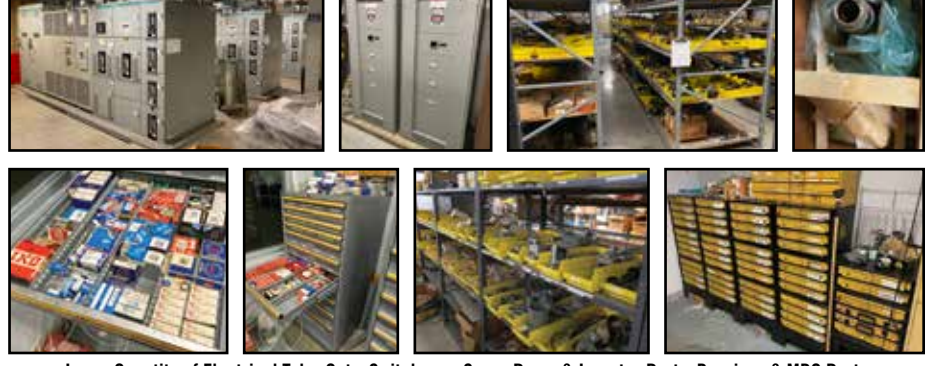
Large Quantity of Electrical Take-Outs, Switchgear, Spare Press & Inserter Parts, Bearings & MRO Parts