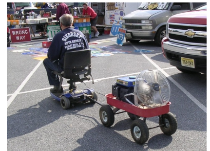
You never know what you'll see

OCTOBER MEETINGS: Saturday Oct. 4, 8:30 AM— Poplar Forest Tour —See Page 2