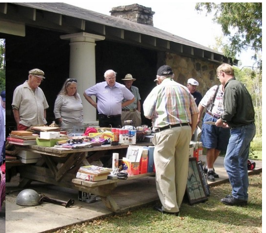
Members check out the variety of donated auction items