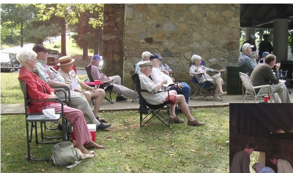
Eager members await the start of bidding