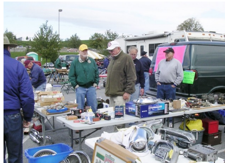
Sunny days are the norm