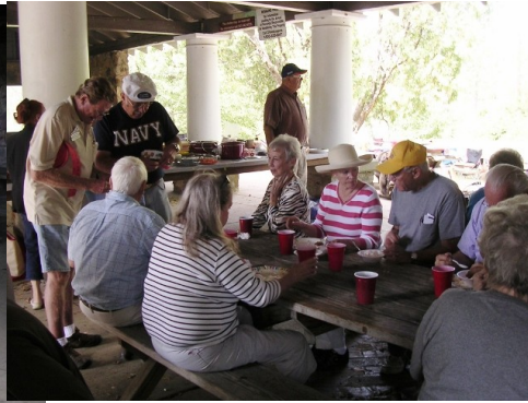
The gang did a good job on the food