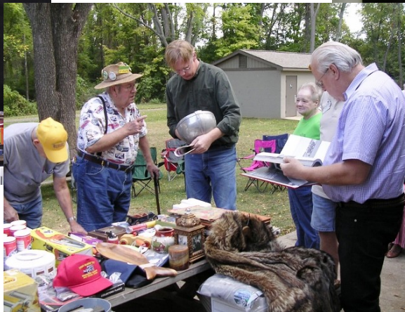
“We’re not sure what it fits but it’s a nice headlight”