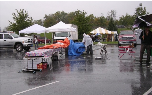
It has been known to rain at Hershey