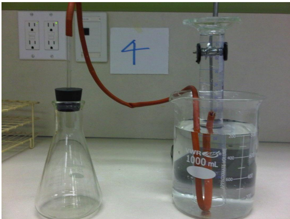
Figure 1: Experimental set-up. Note that the tubing is stable inside the graduated cylinder, and the graduations are easy to read.

(Note: you may need to let some water out of the cylinder so that the initial volume of air is easily measured.)