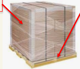
Cartons to edge of pallet not overhanging the