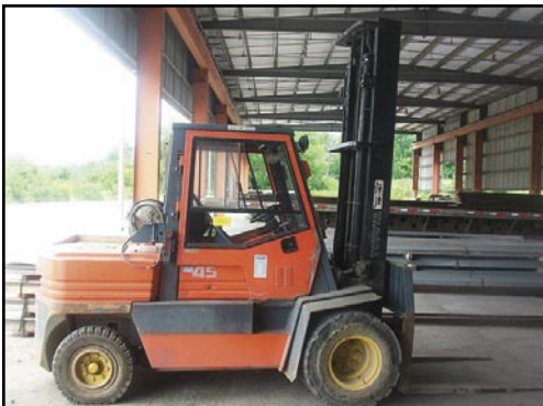
10,000 Lb. Toyota Forklift