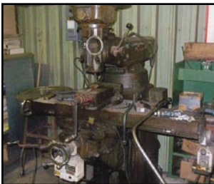
Ex-Cell-O Vertical Milling Machine

32 Stand (Dual 16 Stand & 16 Stand) Pro Eco Duplex Head Rollformer , Used to make 8" to 13" Webb x 3" to 5" Leg, Mounted on traversing base to change from 3" to 5" Leg, Capacity 25" wide x .210" thickness, Spindle Diameter 2 1/4", Rollspace 20" Min to 32" Max, Vertical Adjustment 8" - 15", Horizontal Centers 24", Center drive to each Inboard, Two speed drive 75 HP & 150 HP, Serial #3904-26-82 (Sold via photo - Toledo, OH location)