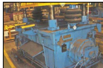
Modified R Panel Line