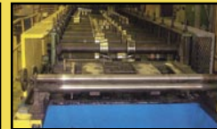
36" Dura-Rib Panel Line