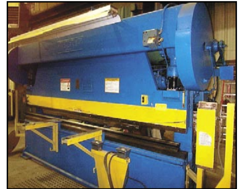
Sturdy Bender Press Brake