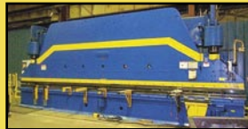
400 Ton Cincinnati Hydraulic Press Brake

Complete 6" Dura-Rib Panel Line, Complete Combination C & Z Purlin Line (12-Gauge Capacity), Late Model Demag Cranes, 30' Hydraulic Brake, 5-Axis CNC Welder & All Support Equipment