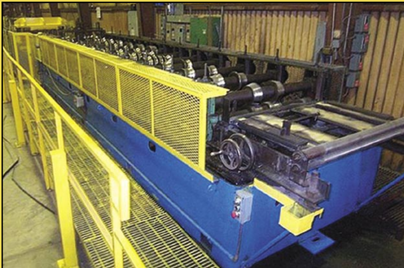
36" Dura-Rib Panel Line