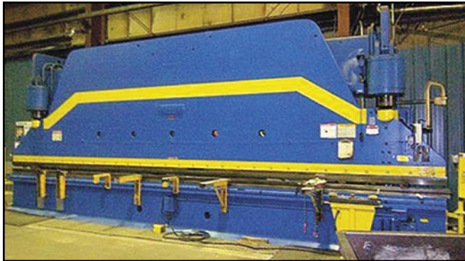
400 Ton Cincinnati Hydraulic Press Brake

Sturdy Bender Mechanical Press Brake , MDL. B-10, Bed and Ram 12' Overall, Capacity 12' x 12 ga. / 6' x 3/16", 4-way die and Hemming die, front arm support, push button controls, safety system, air actuated clutch, floor standing, twin end drive, Allen-Bradley Panel View 550 control, S/N 4330