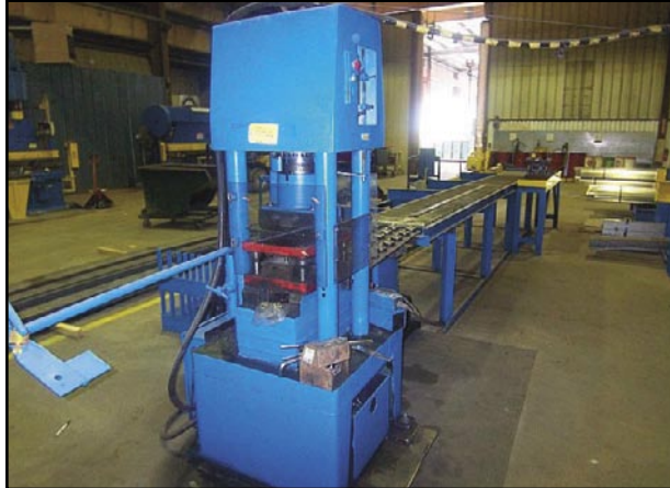
80 Ton Whitney Hydraulic Punch With Eave Struts Die Set