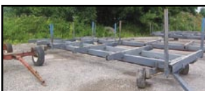
6' x 30' Portable Dolly Trucks