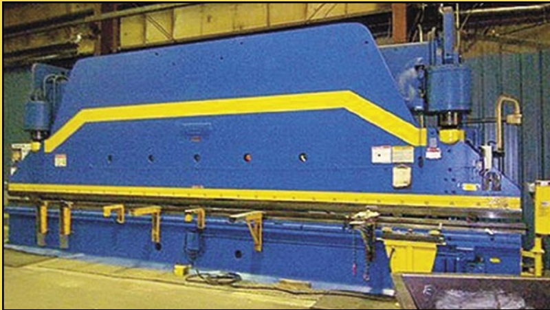
400 Ton Cincinnati Hydraulic Press Brake