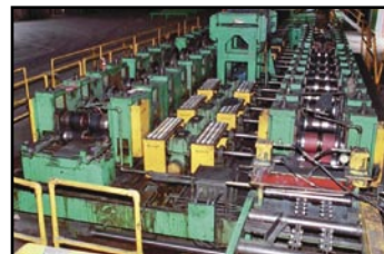
32 Stand (Dual 16 Stand & 16 Stand) Pro Eco Duplex Rollformer