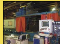
5-Axis Hypertherm Plasma Cutter

11426 Ventura Boulevard Studio City, California 91604 Phone: 818.508.7034 Fax: 818.508.3025 info@biditup.com