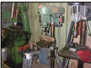
Surface Grinder & Drills