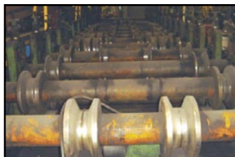
Modified R Panel Line