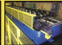
36" Dura-Rib Panel Line