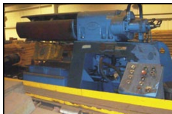
Modified R Panel Line