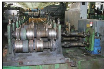
14 Stand ASC Gifford & Hill Rollformer