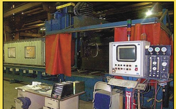
5-Axis Hypertherm Plasma Cutter