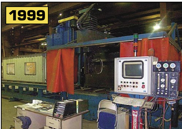
5-Axis Hypertherm Plasma Cutter

LEASE/FINANCING AVAILABLE DIRECT FROM BIDITUP Capital Corporation