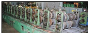
14 Stand ASC Gifford & Hill Rollformer