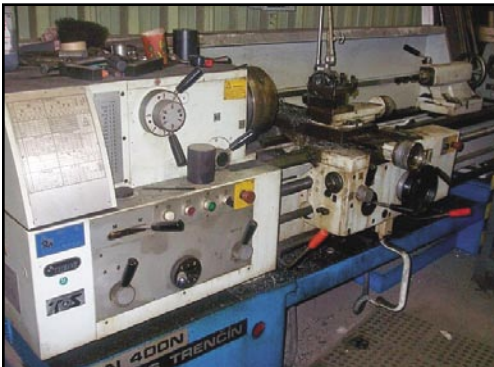
Trecin Engine Lathe