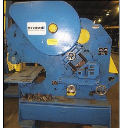
75 Ton Peddinghaus Ironworker