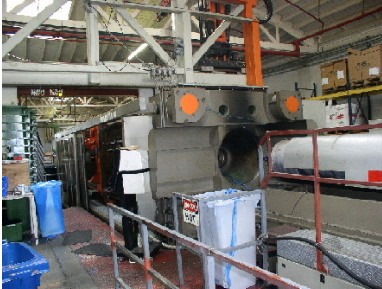
03CA004 Exhibit #1

View of the plastic injector mold involved in this incident.