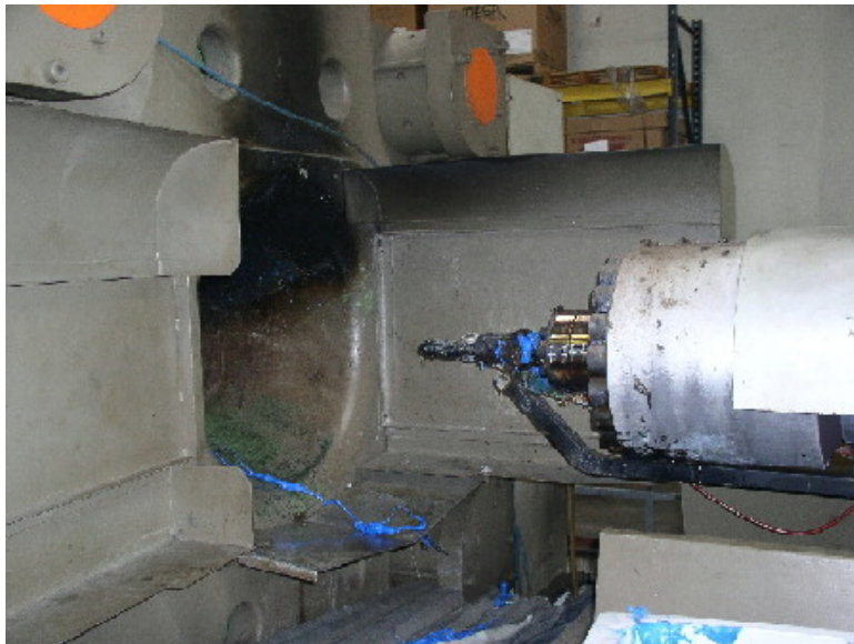
03CA004 Exhibit #2

View of the plastic injector mold involved in this incident.