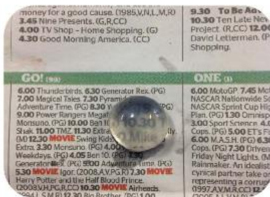
The lens was removed from the eyeball used to magnify lettering on the newspaper.