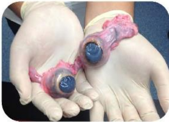
A Pair of Cow's eyeballs - Ready to dissect