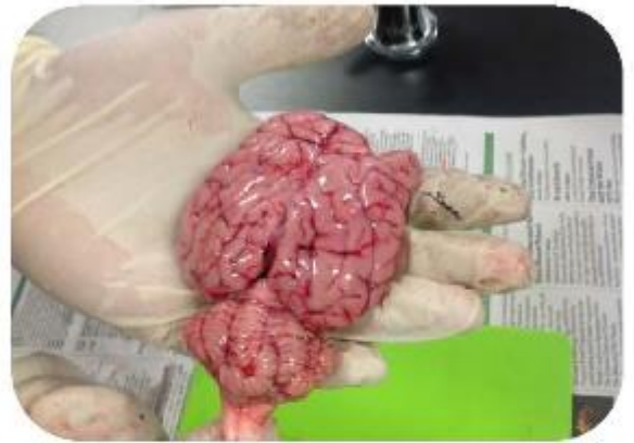
Biology students gained so much from dissecting the sheep's brain.