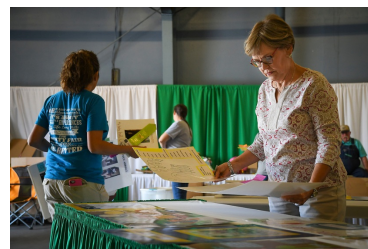
Exhibit Day & Exhibit Display Check-Out Volunteers Needed! We need adults and youth! Click HERE to sign-up to help.

Volunteers Needed for 4-H Floats at Parades & Rodeo Events. 4-H Youth, Leaders, Parents & Families Welcome - Click HERE to Sign Up!