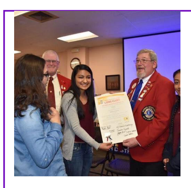
14 January of 2017 @ Hooksett public library