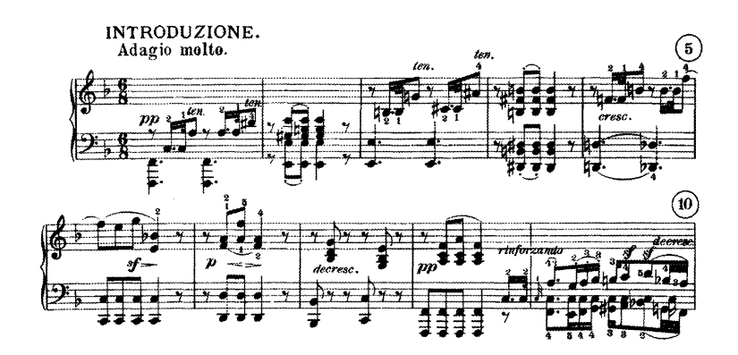
Example 1. Beethoven, Piano Sonata No. 21 in C major, Op. 53, Second Movement, mm. 1-10.

Waldstein' sonata, provides a nice example of the connection between active synthesis and function ascriptions. Recall that the tonal function of a chord is its meaning within a key (Riemann 1893, 9). Yet the main key of a movement is not always apparent at the local level. Since we are constantly and actively synthesizing different moments in musical hearing, how we understand these moments depends on how they are grouped. Because of the "peculiar, fragmentary nature" of the Waldstein second movement opening, Riemann warns, there is a risk of incorrectly locating the boundaries between motives (Motivbegrenzung). However, once we have heard the whole introductory section (mm. 1-9), we know the meaning of its different parts: "In light of the significance that the wistful, upward-reaching thirty-second-note motive attains in the course of the introduction [...], it would only be correct to see it as already beginning in the first bar." 103