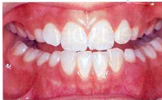
Figures 3A and 3B —Example of brown fluorosis staining, which may require as long as 2 months of at-home treatment or as little as 1 week.