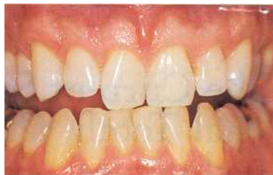
Figures 1A and 1B—Yellow discoloration usually responds well either to several in-office treatments or to at-home treatment.