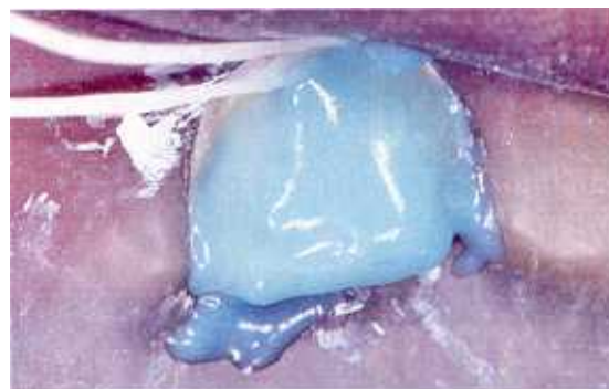
Figure 5 —Example of a tooth being treated with a dual-activated 35% hydrogen peroxide. Tissue isolation was performed with a rubber dam and ligation. After application, the whitening product was activated with a curing light.

According to Dr. Blankenau, one reason that patients may not get good results with OTC products is compliance: "They may just not be using the products properly or long enough." Without a clear understanding of what to expect in specific clinical circumstances, outcomes can easily fall short of expectations. According to Dr. Goldstein, another reason that expectations may not be met is that patients may not recognize that their teeth have discolored composite restorations or crowns that will not be affected by