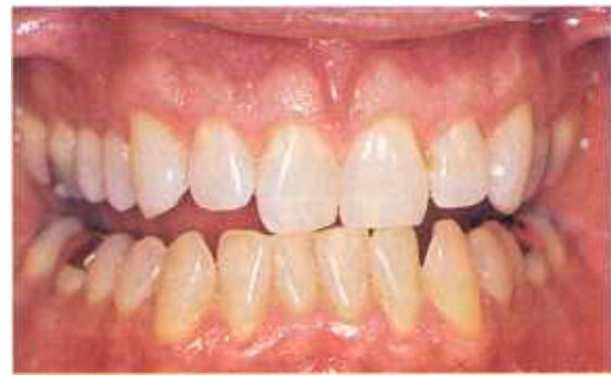
Figures 7A and 7B—Before and after treatment photos showing a mild color change that may not be acceptable to some patients.

ble changes from scanning electron microscopy studies of in vitro enamel surfaces as a result of exposure to as many as 1,000 hours of carbamide peroxide. 22,23 Therefore, the fear that this process will eventually dissolve away the enamel surface is not supported by current research (Figures 6A and 6B). 24