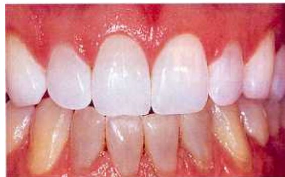
Figures 4A and 4B —Blue-gray tetracycline discoloration may require several months of at-home treatment. In-office treatment may be used to shorten overall treatment time, but the effectiveness of additional in-office treatment cannot be determined beforehand.

applied systems and dentist-prescribed home-applied systems. The latter implies that an examination and diagnosis has been made to determine the etiology of the tooth discoloration and the appropriate treatment method and protocol has been prescribed.