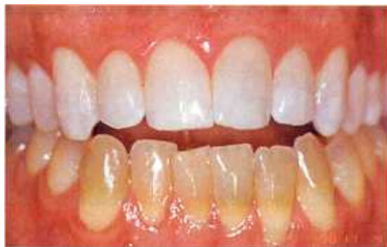
Figures 2A and 2B—Banded discoloration may not respond as well to treatment as other types of extensive discoloration.