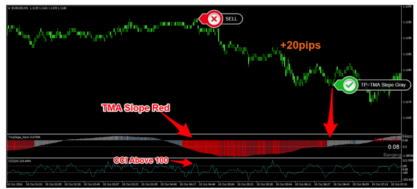
The 1 Minute Scalping Strategy Using the CCI and Slope Indicator

If you're a scalper trader who likes the feeling to be in and out of the market very fast than the 1-Minute scalping strategy using the CCI and the TMA Slope MT4 indicator might be a great scalping strategy to trade with. Trading with faster charts like the 1-minute time frame can be very dangerous for many traders; however, by using the TMA Slope indicator you'll only be taking the high probability setups. The TMA Slope indicator is a complex technical indicator that can read the market conditions quite well and in this regard when we have tight range conditions it will keep you away from taking bad trades. The precision of this strategy is unmatched which is one of the benefits of trading the 1-minute chart.