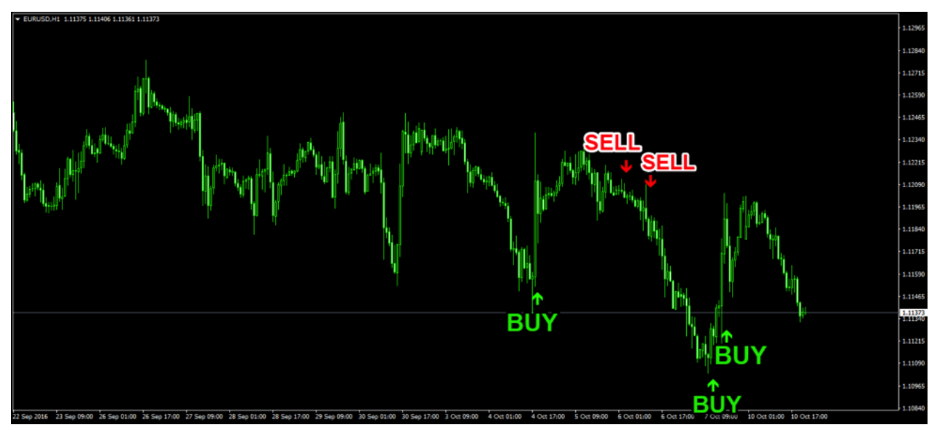
Price Action Trend Strategy