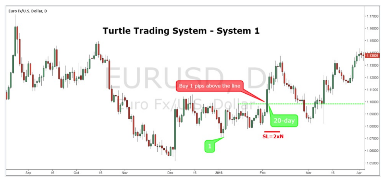
The Legendary Turtle Trading Strategy makes it to our Top 10 Best Forex Trading Strategies