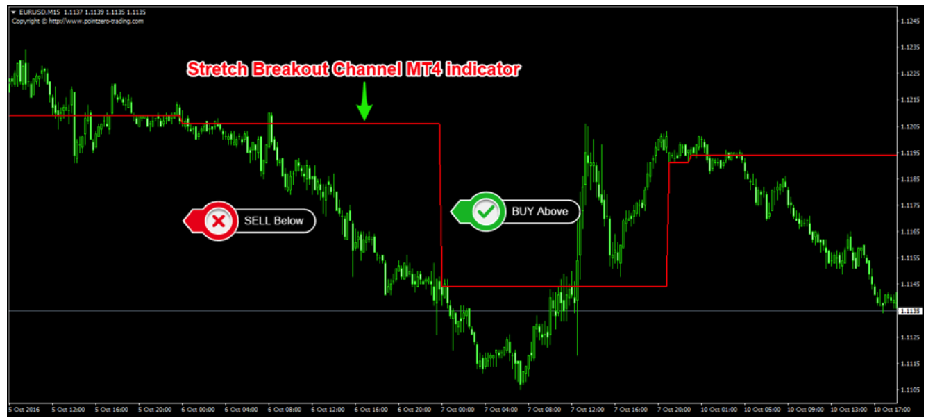
Stretch Breakout Channel Strategy

The Stretch Breakout Channel strategy is a scalping strategy designed for the short-term trader that wants to take advantage of the usual breakout move that happens during the London and New York session. The strategy uses the power of the momentum to determine whether a rally has behind real buying pressure or whether a sell-off has behind real selling pressure. If you're tired of the false moves around the openings of the major trading sessions, this is a pretty good strategy. The Stretch Breakout Channel MT4 indicator can also be used independently to trail your stop loss and can be a great tool to be incorporated into your personal trading strategy.