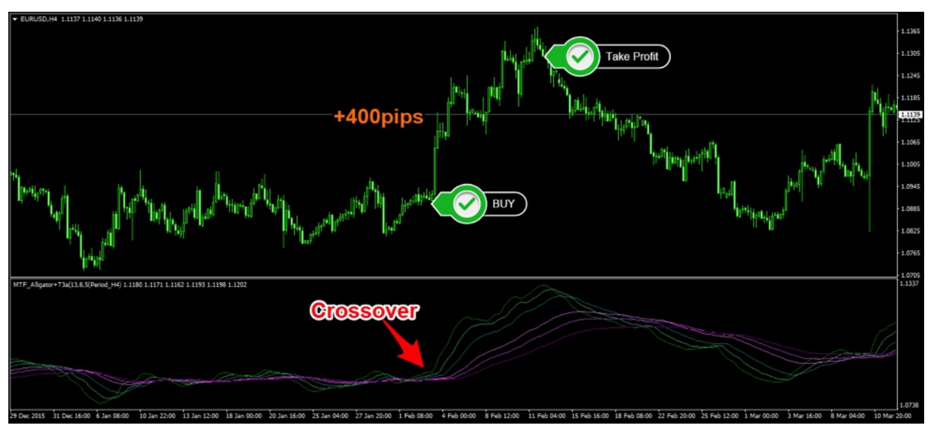
The Alligator EMA Crossover Strategy is considered one the Best Forex Trading Strategies because of its simplicity