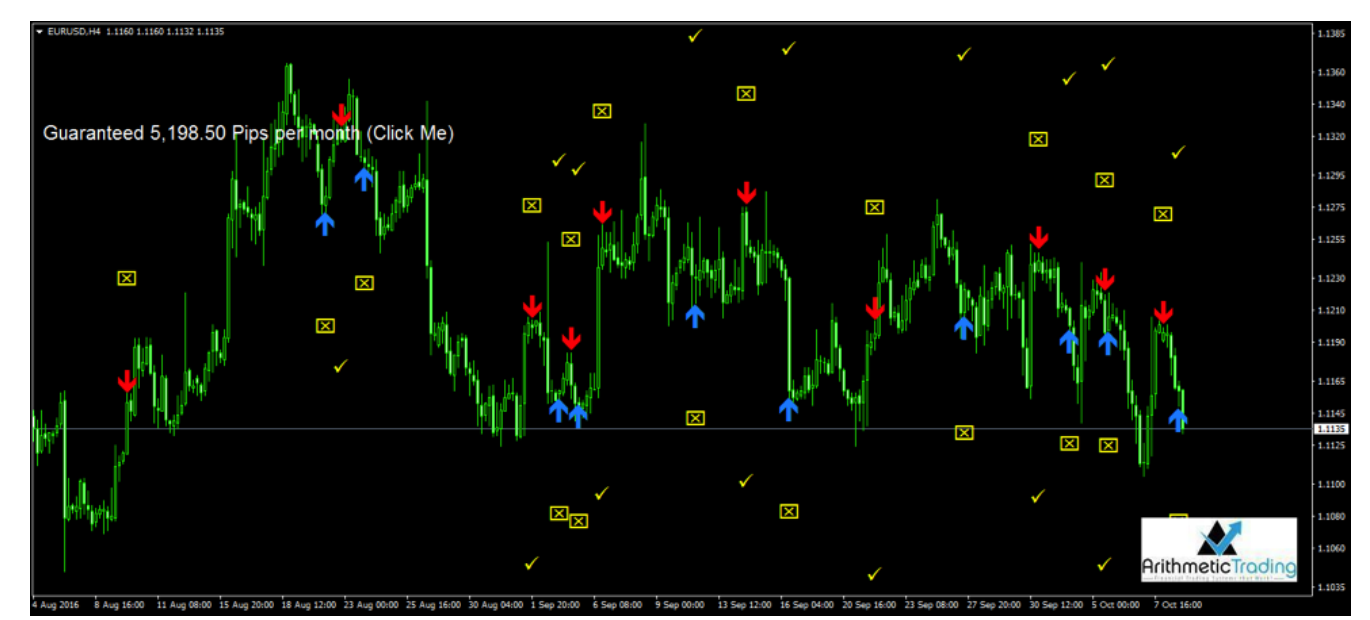
We included The USDCAD Trend Strategy in our top 10 selection of Best Forex Trading Strategies

The USDCAD is one of the most traded currency pair and certainly the price action is much easier to be read. The USDCAD Trend Indicator is a trend following strategy designed to generate buy and sell signal. The USDCAD Trend strategy is constructed based on the CCI indicator, but it's a much more complex and versatile version. If you're having problems with not knowing where to buy or sell and more importantly, where to place your protective stop loss or where to take your profits than the USDCAD Trend strategy is very intuitive and easy to follow strategy. This strategy potentially can generate for you more than 5000 pips per month when executed correctly.