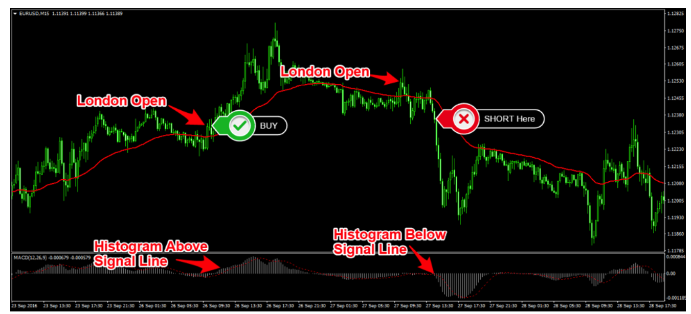
One of the Best Forex Trading Strategies - The London DayBreak Strategy

The London DayBreak Strategy is a day trading strategy that takes advantage of the London open trading range. It's a momentum breakout strategy that only requires up to no more than 15-minutes of your time. The London DayBreak Strategy only makes use of two simple technical indicators: the MACD which is a trend-following momentum indicator and the 50-EMA. A buy signal is generated only when we're trading above the 50-EMA and the MACD histogram is raising above the signal line and vice versa for a sell signal. The preferred time frame for the London DayBreak Strategy is the 15-minute time frame.